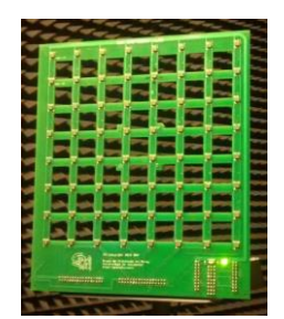
Fig. 2. Array of MEMS microphones.

The array characterized in this paper is based on a Uniform Planar Array (UPA) of MEMS microphones. This is a square array of 64 (8x8) MEMS microphones which are spaced uniformly, every 2.125cm, in a rectangular Printed Circuit Board (PCB), with square gaps between the acoustic sensors, as it can be observed in Figure 2, in order to make the array as light and portable as possible.