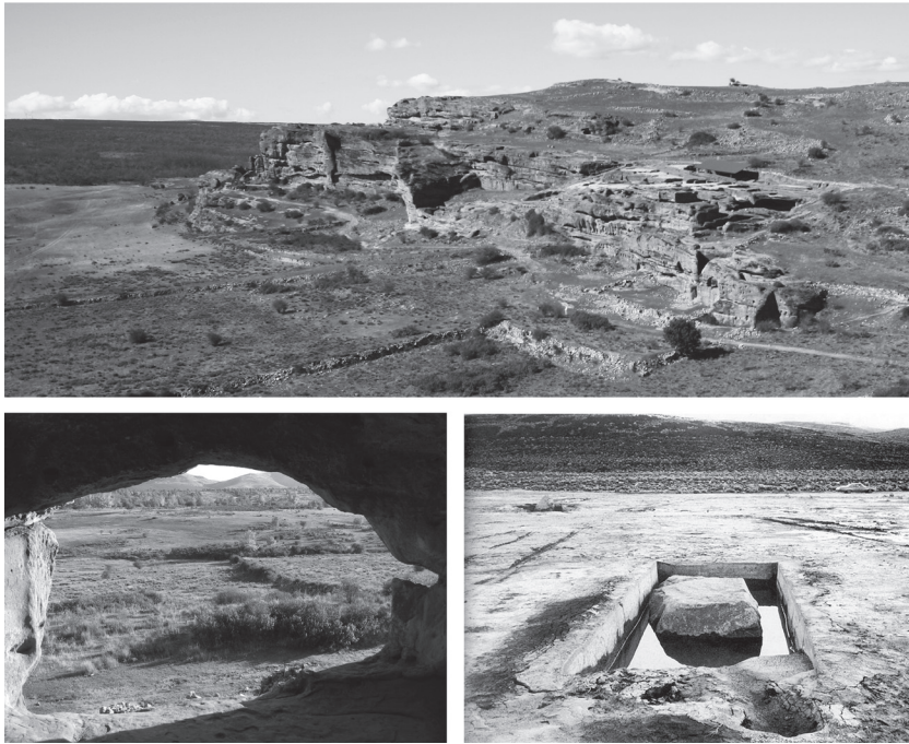
FIGURE 1. Rocky landscape of the south face of Tiermes, result of anthropic actions (above). Excavated architecture of Tiermes into the surrounding landscape (below left). Displaced / Replaced Mass , Desert of Nevada, Michael Heizer, 1969. Reading archeology and landscape by extraction, positive topography and empty space (below right)