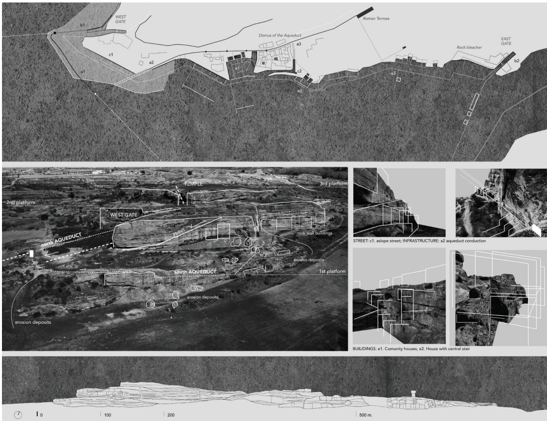
FIGURE 4. Proposals studies for landscape intervention on the southern front of Tiermes: plant, diagrams excavation-transport-construction-erosion and elevation.