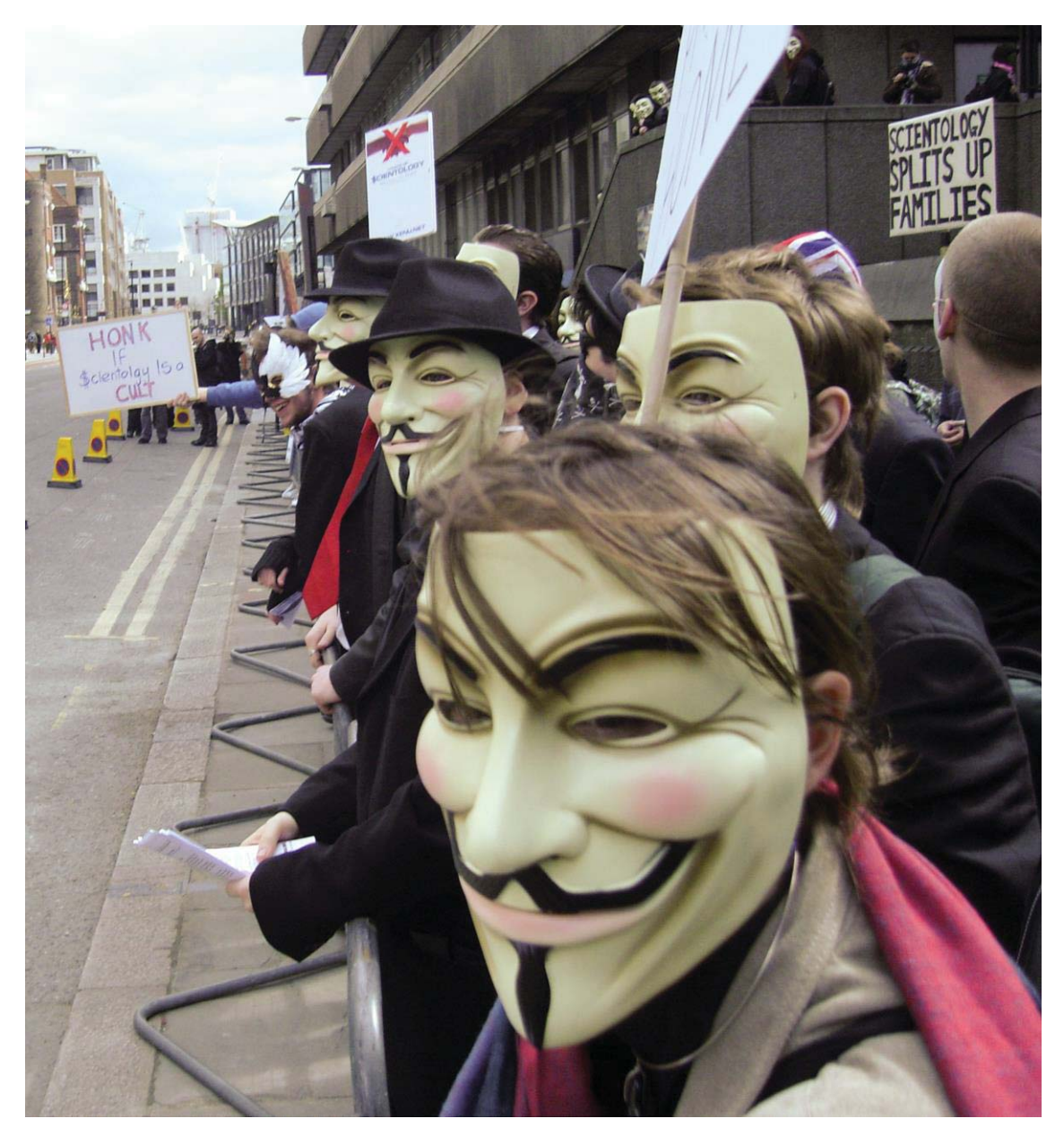
Members of the group Anonymous wearing Guy Fawkes masks at a protest against the Church of Scientology in London, 2008. Creative commons international licence.

But it is not only the fact that they wanted to represent anonymity, but also the fact that they did not want to protest in front of Scientology buildings as individuals but as a group, a