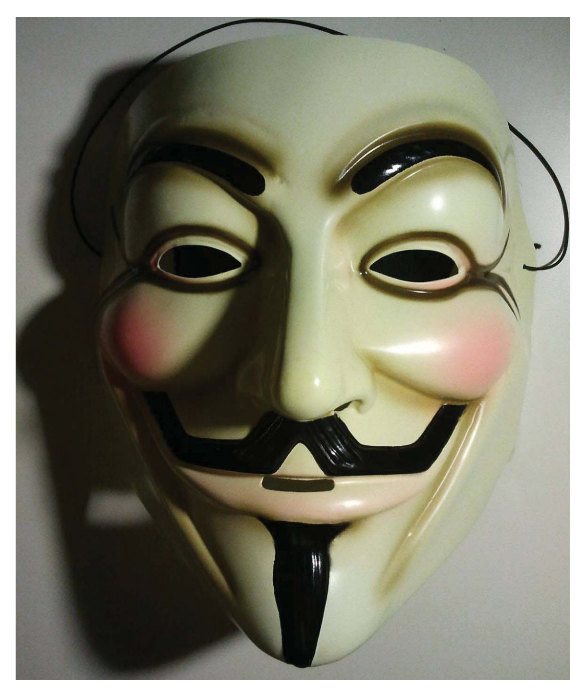
A contemporary Guy Fawkes mask (Original mask of Guy Fawkes from the film V for Vendetta at the Musée des miniatures et décors de cinéma (fr) in Lyon, France.) Creative commons international licence.