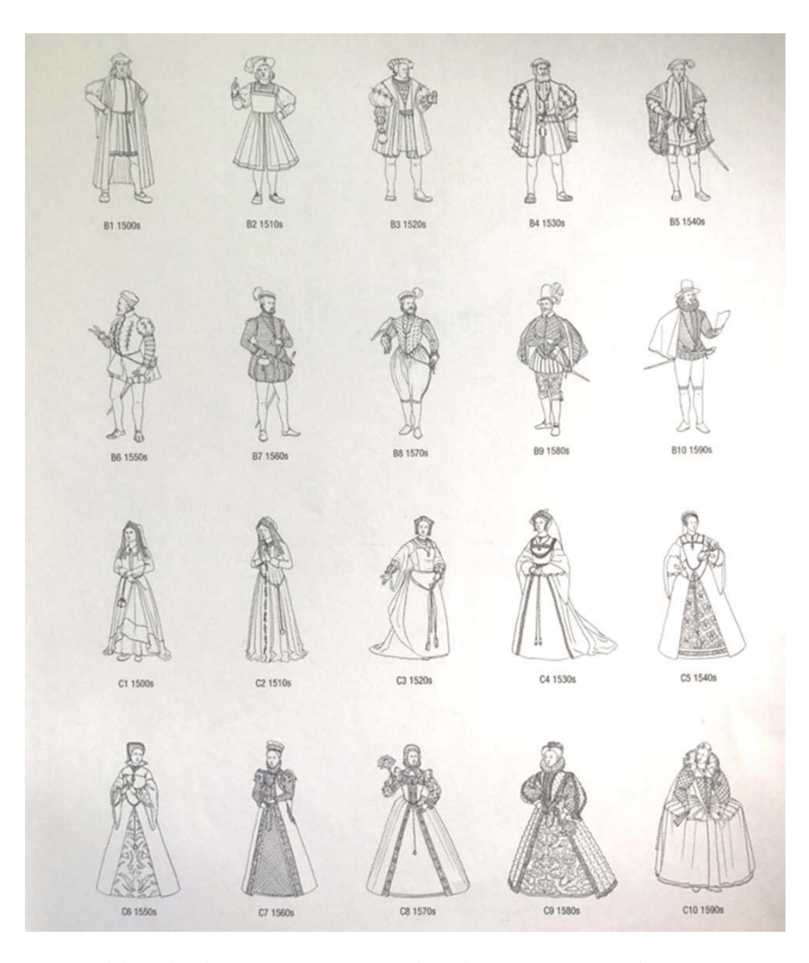
Source: Niniya Mikhaila and Jane Malcolm-Davies, The Tudor Tailor (Batsford, 2006) pp.12-13

As can be imagined, it must have not been an easy task to dress in adherence to Elizabethan fashion, especially if you belonged to the elite and, even more, if you were a woman. Now this essay will describe the main pieces of garment worn by Tudor women of the elite, together with their patterns, fabric, and colours, before considering four of Queen Elizabeth's portraits in order to demonstrate the characteristics and transformation of her dressing style.