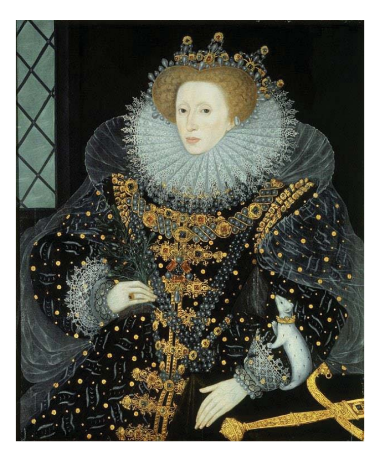
The 'Ermine' Portrait