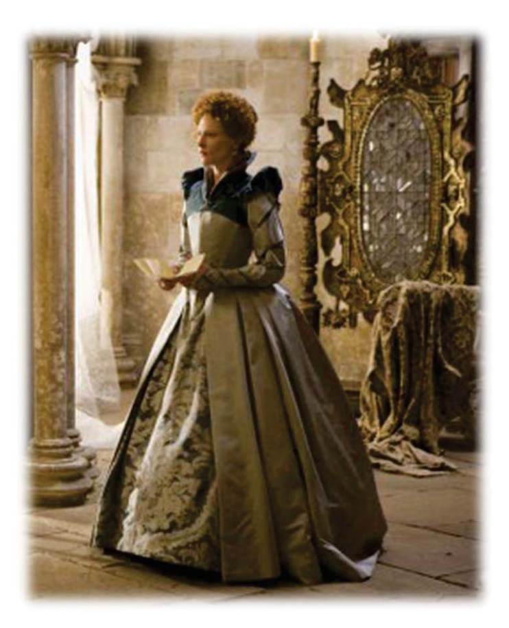
Figure 20. Elizabeth I in a silver-blue gown

Subtracted from "Elizabeth: the Golden Age", 2007 by Shekhar Kapur.