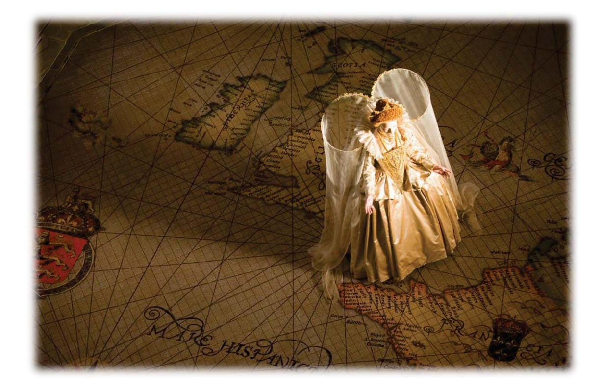
Figure 23: Elizabeth I in the Map Room

king and queen exclusively; duchesses, marquesses and countesses could wear it, but only in their kirtles and sleeves.