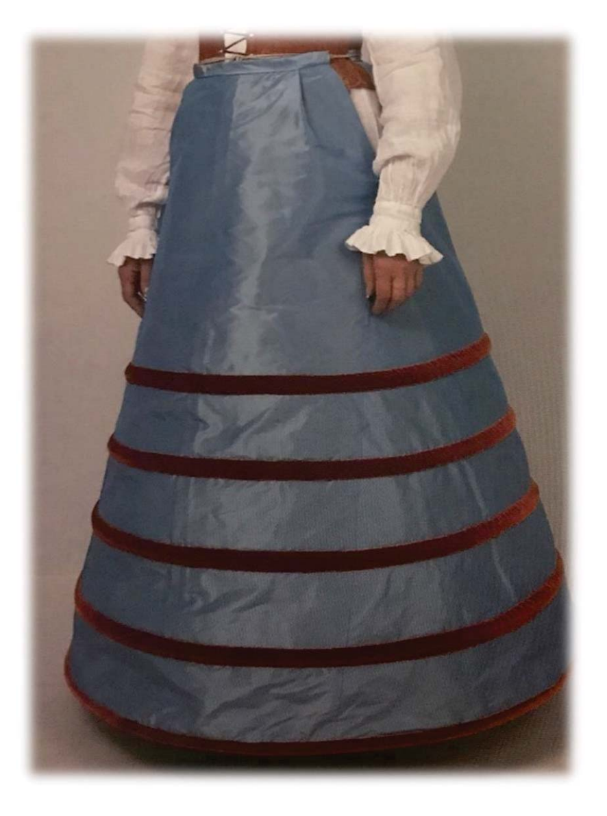
Figure 9. Spanish Farthingale

Skirts and petticoats did not need a lot of fabric, since, from the 1540s onwards, they were meant to be worn over a large, either Spanish or French, farthingale. Farthingales were thick supports worn under the skirt in order to provide more volume. Rolls were tied under the large French farthingale to support heavy skirts (Mikhaila, Ninya, and Jane Malcolm-Davies, 122).