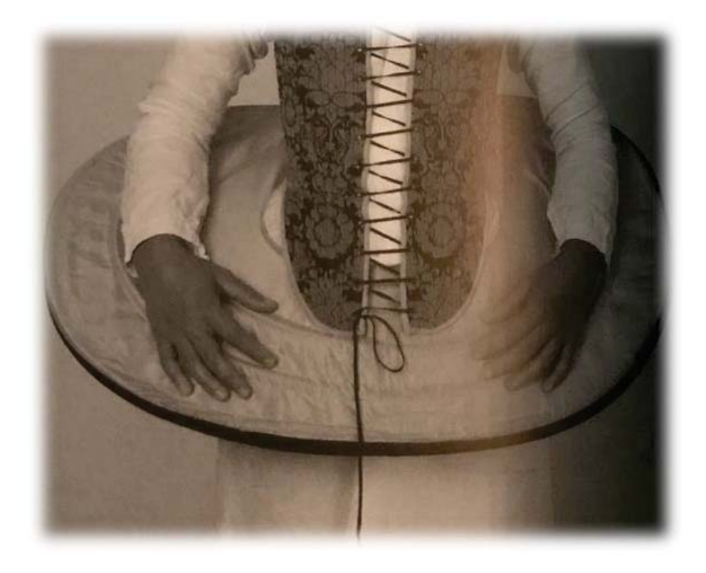
Figure 10. French Farthingale

Source: Ninya Mikhaila and Jane Malcolm-Davies. The Tudor Tailor (Batsford, 2006) p. 124