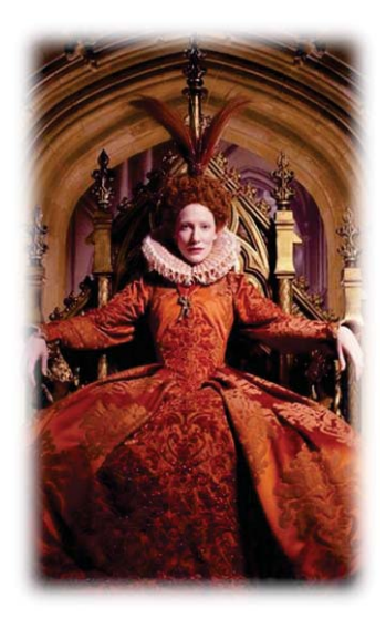
Figure 18: Elizabeth enthroned in a crimson gown.

Source: Elizabeth: The Golden Age (2007) by Shekhar Kapur. Substraed from "Costume & Movies". Pinterest, 2017.