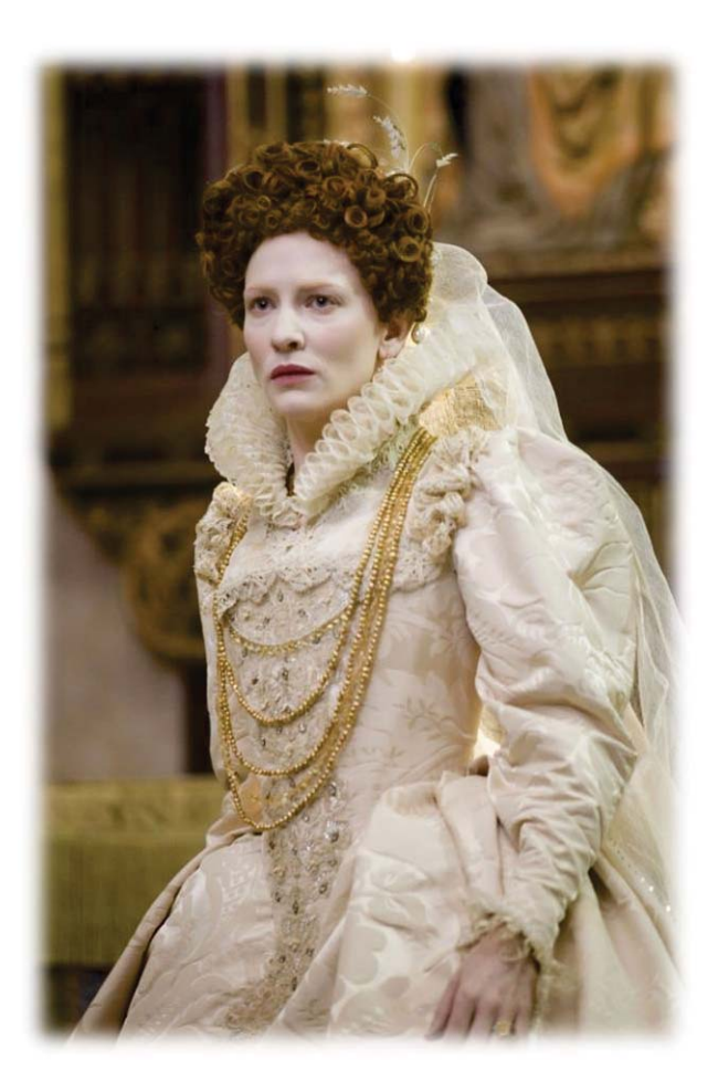
Figure 21: Elizabeth I in a white gown

Subtracted from "Elizabeth: the Golden Age", 2007 by Shekhar Kapur.