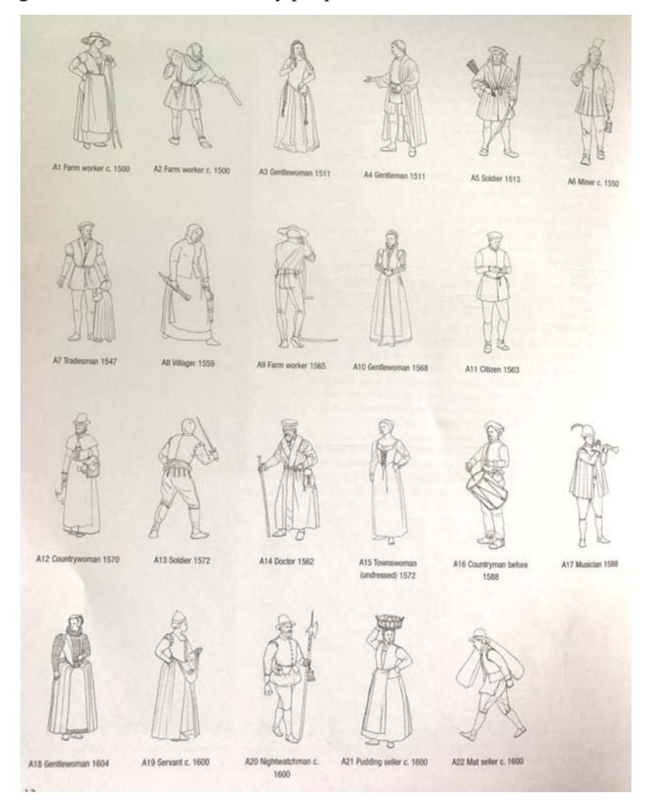
Figure 5. Evolution of ordinary people's clothes and clothes of the elite.

The late Elizabethan era was marked by a noticeable evolution in clothing, mainly in women's garments, especially between the 1570s and 1590s. It can be assumed these changes were caused by the Greenwich Acts of Apparel which Elizabeth enforced in 1574 and which brought women within its terms. As seen in the illustrations below, a clear difference exists between the austere clothing of commoners and that of the nobility. Also apparent is an evolution of style throughout the period, which was most marked in the last ten years of Elizabeth's reign.