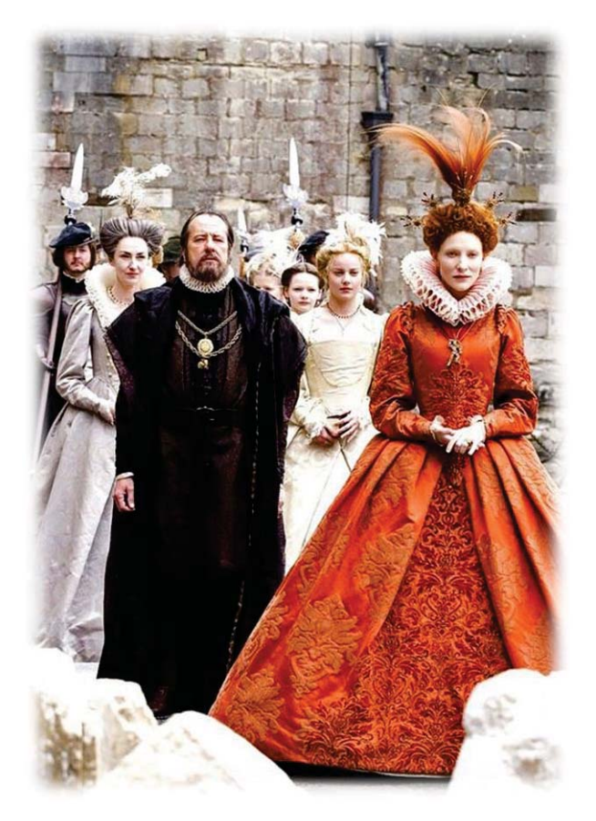
Figure 19. Elizabeth among courtiers and ladies-in waiting

It is quite symbolic to find Elizabeth in an astounding crimson gown the first time she appears on screen. It is also significant, because of the association of red-hue silk colour with royal status. Let us remember how, according to her own proclamations, the different shades of red ("purpure", crimson, scarlet) were only allowed to be used by the King and Queen, their family and higher nobility, especially when these were wearing gowns made of silk or velvet, and these were embroidered with gold, silver or pearls. The scene depicts her giving her opinion among her advisers, those being men, whose costumes contrast markedly hers. They are clothed in black, and her ladies-in-waiting, in white and grey hues.