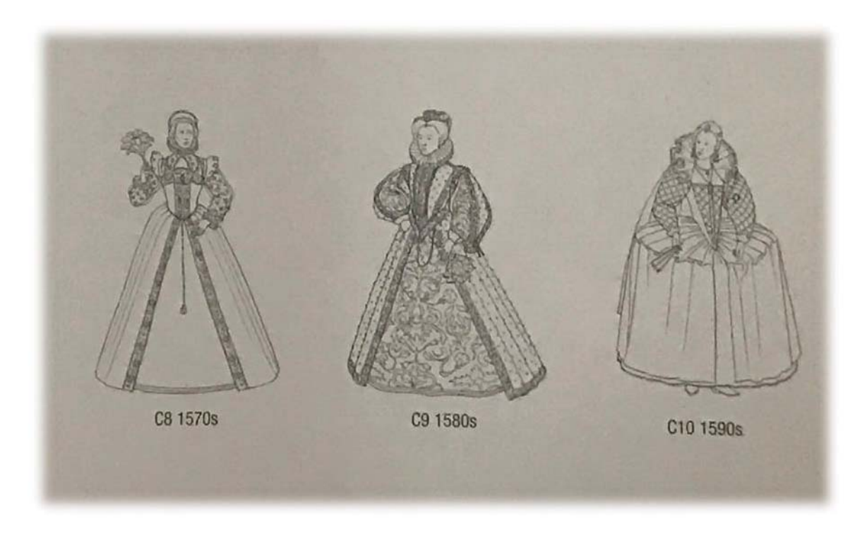
Figure 13: Late Elizabethan noble women's clothing evolution

significant portraits from the second half of her reign are analysed, not before considering the sequence of style illustrated below: