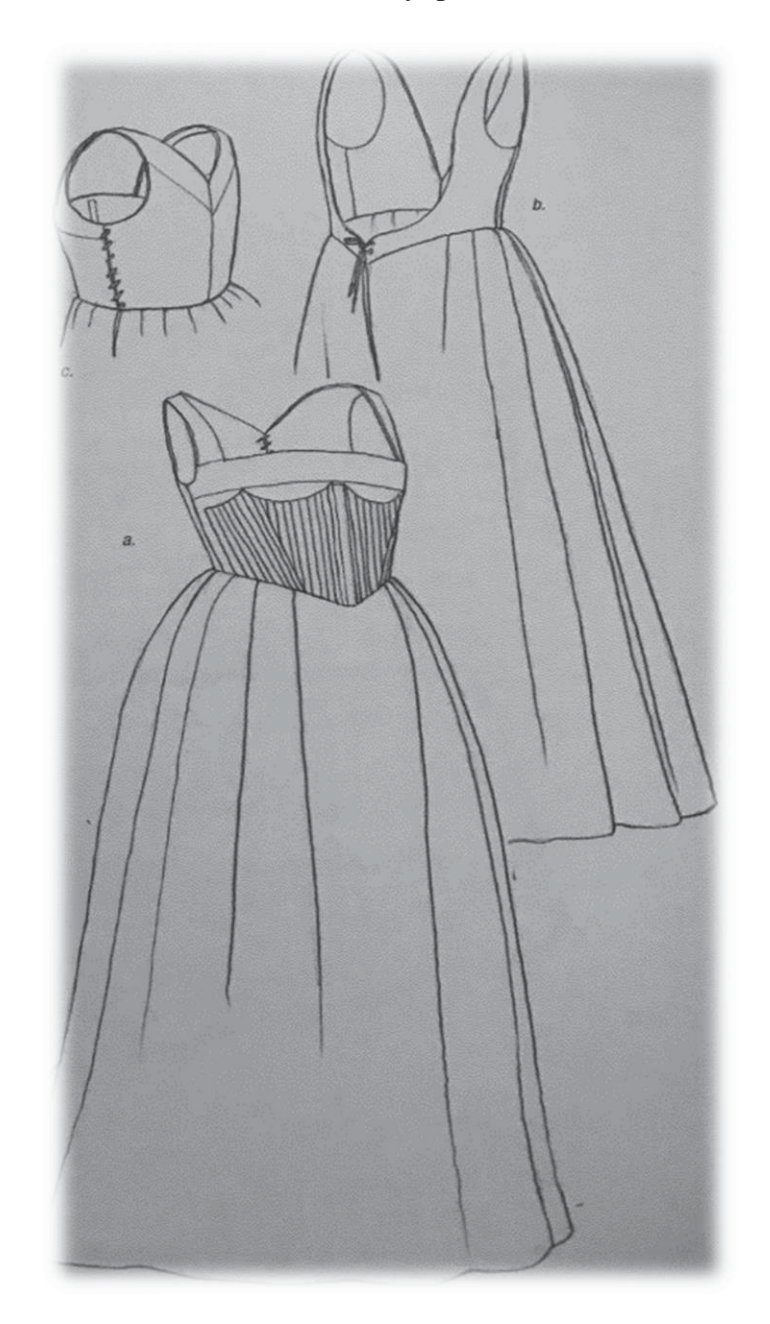
Figure 6. Fashionable Henrician lady: petticoat and kirtle

Source: Ninya Mikhaila and Jane Malcolm-Davies. The Tudor Tailor (Batsford, 2006) p. 105