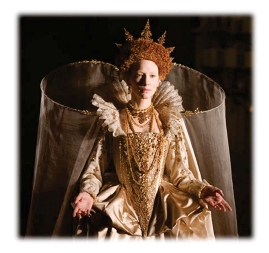
Figure 22: Elizabeth I in a golden gown

Source: Subtracted from Elizabeth: The Golden Age (2007), by Shekhar Kapur.