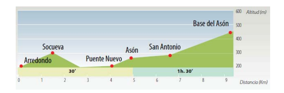
Figure 6. Altitude-distance graph

Overall, the information presented throughout the websites achieves its referential purpose that has to do with describing a route, yet they can be improved by making the visual content and the arrangement of the information more appealing to the tourist. Such improvement could be achieved by adding more photographs of the trail described, as they are an essential part of a walk's identification and a destination's promotion. In other words, the role of the photographs is to provide a real-life image of the route so that hikers can easily recognize the place when they are travelling. Consequently, since the content of these routes is included in an online format, it offers multiple variations as well as flexibility, unlike the case of printed touristic leaflets, as previously mentioned in the theoretical background section.