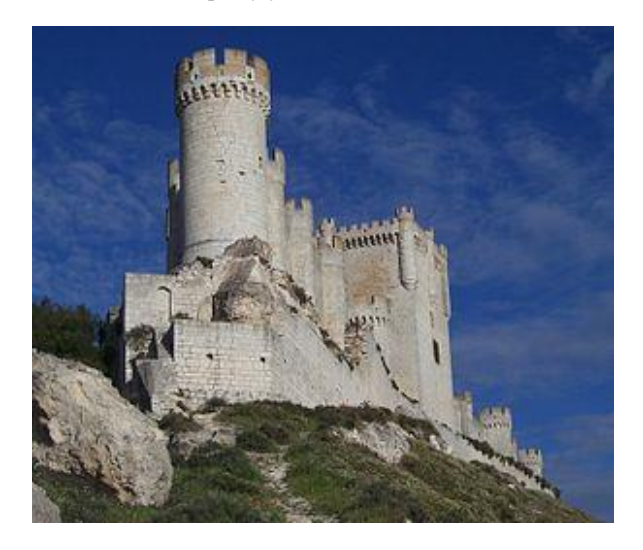
Figure 2: Peñafiel castle.

In which municipality you can find this fortification?