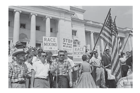
Bledsoe, J. T. (1959). Little Rock Integration Protest . Library of Congress, U.S. News & World Report Magazine Photograph Collection.