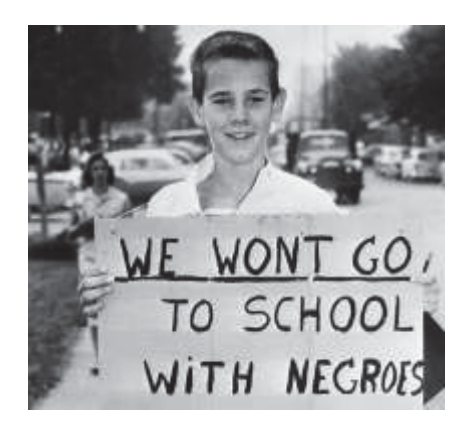
Bettmann. (1956). Student Protesting School Integration. Getty Images.