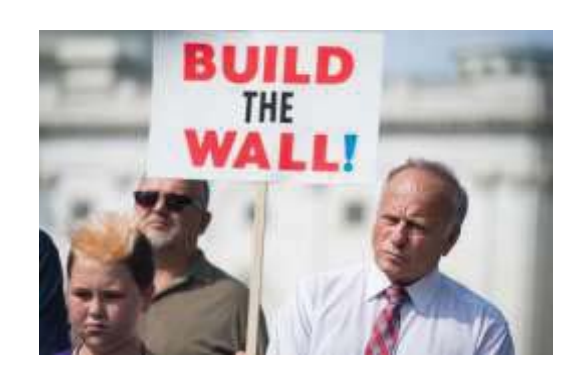
Williams, T. (2018). Representative Steve King (R-IA) attended a rally with Angel Families on the East Front of the Capitol, which highlighted crimes committed by illegal immigrants in the United States. The Nation.