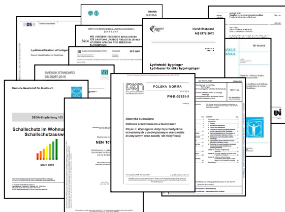
Figure 1 – Classification schemes in Europe have been published since the 1990es, most of them by national standardization organizations. Only in Germany, schemes have been published by "private" organizations. An overview of schemes is found in Table 4.

Sound insulation requirements and class criteria are expressed by descriptors defined in standards. Within building acoustics, ISO standards are implemented as European (EN) standards and national standards, the main standards being [5-9]. Outside Europe, building acoustic standards referred to may be from ISO or from other standardization organizations. In this paper, results from comparative studies are mainly from Europe and primarily about airborne and impact sound insulation between dwellings, the international sound insulation descriptors being defined in ISO 717 [5]. The current situation in Europe for national ACS is illustrated in Figure 1 showing front pages of several national classification standards individually developed without coordination between countries and with widely different contents.