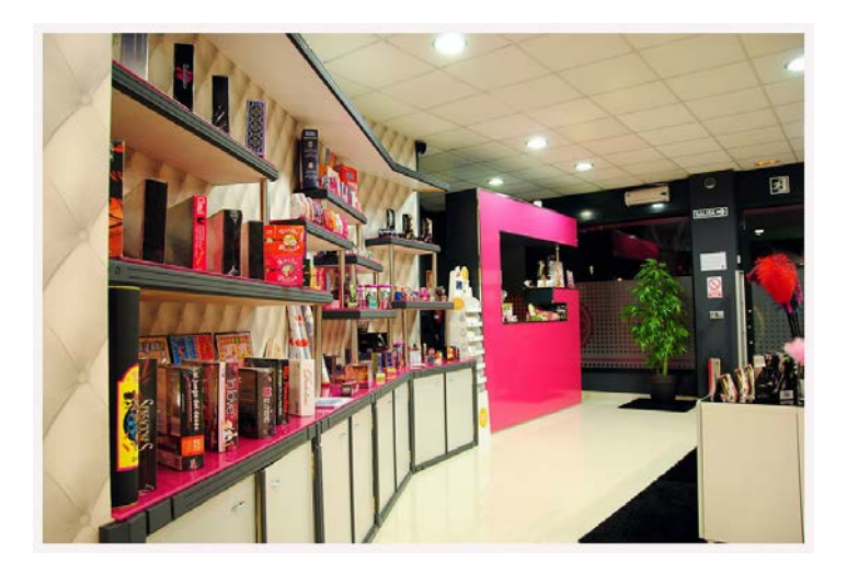
Fig. 3: Erotic Shop Punto G. Narón (Galicia). Photo by the author

Sex, in historical moments pushed into the shadows of privacy, intimacy and indecorousness, emerges in the modernity as a public, social and essential entity. Explicitly or not, its presence has been magnified, everywhere – it is kitsch and cool at the same time – it is not only in fashion, but it also has become self-referential (there is no need of