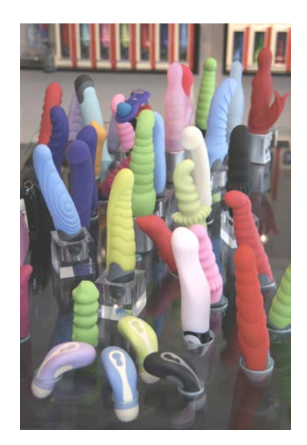
Fig. 2. Different vibrators at the Funfactory flagship store in Berlin, Germany (2009).