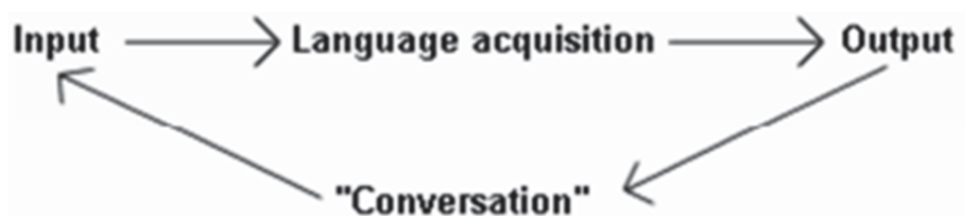
Fig. 3.1. How output contributes to language acquisition indirectly.

vicious circle that feedbacks itself. In Krashen (1982, p. 56) it is described this way: