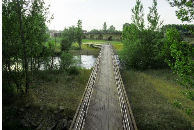
Figure 4: Footbridge for pilgrims of the Camino de Santiago in Puente Villarente. The broken line gives us way into the landscape. LABPAP, 2010.

This broken pass over the river Porma builds a metaphor. When descending towards the river, pilgrims get away from the real world, focusing on the path they are going through. They are abstracted along a stretch of nature to discover at one point the great experience of all the memories of the place (Álvarez, 2010: 100). On the one hand, they find out the previous history of the path, the bridge where pilgrims have made their way since at least medieval times. On the other, it is reopened before them, the continuity of their route to Santiago. The different breaks introduced on the catwalk are actually living the condensed metonymy of all Camino de Santiago, they conform a part of the journey where we can reconstruct the entire route. (Figure 4)