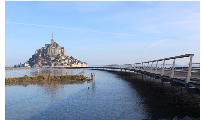
Figure 3: Mont Saint Michel and its new pier for high tide. The curved line allows the free contemplation heritage. Photographer: Mathias Neveling, 2014

The traveller now has discovered the presence of this cultural landscape and is tempted to stop at rest areas, linked to the quarries to see the compound space. This situation is adequate, but for Lassus it is not the purpose of his project. The landscape is nature transformed through human experience and begins to be understandable by a wide range of experiences. That is why landscape emphasizes its own presence thought this highway. (Figure 3)