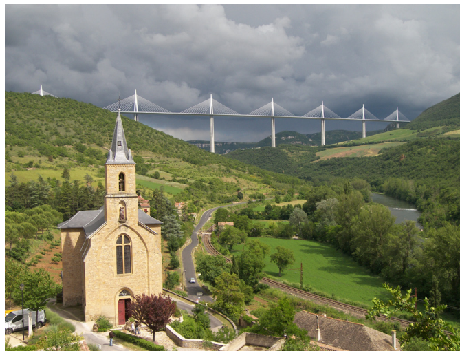
Figure 1: Millau Viaduct. View taken from the village of Peyre. It can be observed how the viaduct appears into the valley as an integrated element more.

The road deck crosses the valley at high altitude, on top of the tallest cable-stayed, masted structure ever built in Europe (2.46 km long and 245 m maximum height). These slender columns are broken into two to make a flexible joint with the road. At the same time it reminds us the image of large sewing needles (Foster and Partners, 2009: 72) as if it were a huge sculpture of Claes Oldenburg, which helps to emphasize the lightness of the infrastructure. The bracing structure continues to rise into the sky, increasing the slenderness of the assembly and giving a gesture that takes us on cloudy days to a second metaphor as a structure reminiscent of naval candles. (Figure 1)