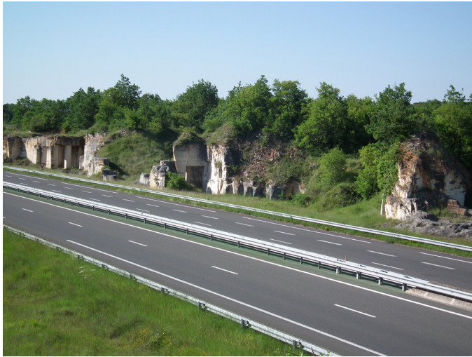
Figure 2: View of Crazannes Quarries crossed by 837 Highway in France. The route brings us the heritage image. Photographer: Cobber, 2010.

The viewer makes a real initiatory journey through all the different points of view that gives you access, discovering the cultural landscape guided through the design of the infrastructure itself. (Figure 2)