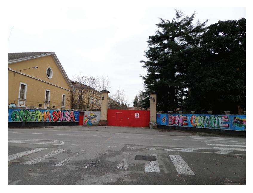
Figure 2. The graffiti "Caserma Salsa Bene Comune" (Salsa barracks as Common).

barracks for three days in November 2012 to protest against the austerity policies of the Italian government. They organized several initiatives: the projection of the movie "Debtocracy" about the causes of the Greek debt and possible measures to counter austerity policies, art workshops, and a hip-hop festival with local underground groups (Global Project 2012). "ZTL Wake Up!" occupied Salsa barracks in Treviso for a few days to reclaim the space for local citizens (symbolized by graffiti on the entrance; Figure 2) and to highlight its state of serious decay, but without coming up with any concrete proposal.