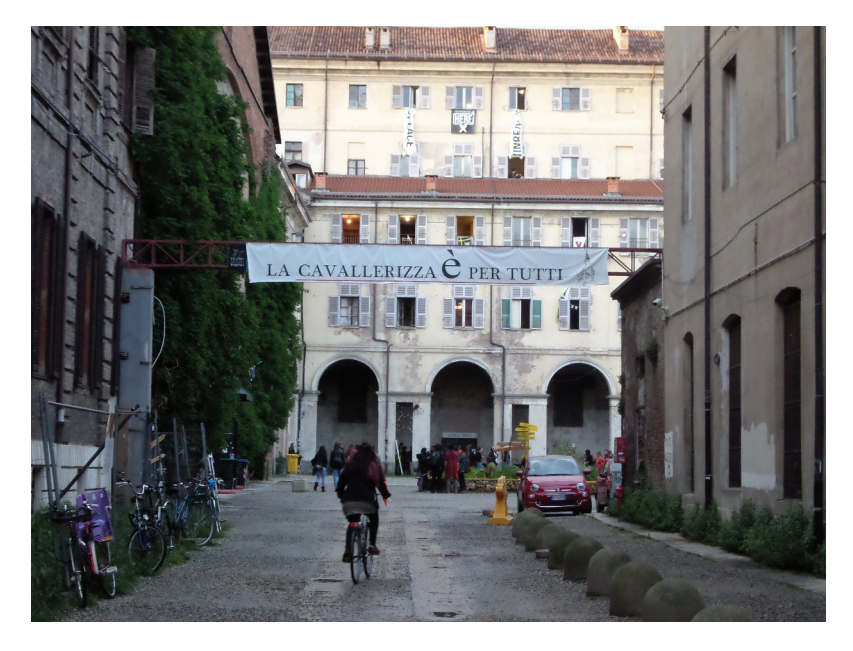
Figure 4. An image of the interior spaces of Cavallerizza barracks with the banner "La Cavallerizza è per tutti" (Cavallerizza is for everyone).

The Cavallerizza barracks became the property of the City of Turin in 2007. (Figure 4) The intention was to sell it to private investors to install a museum. However, a citizens'