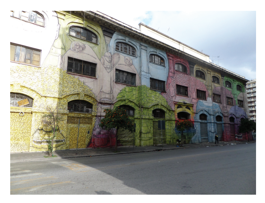
Figure 5. The exterior wall of Porto Fluviale barracks.

with recreational and cultural activities. In 2007 the site was given the "emergency housing status" to temporarily accept informal placemaking, while the MoD attempts to sell the site on the real estate market failed in 2010 and 2014. Meanwhile, the international artist "Blu" covered the exterior walls with 27 faces representing the ethnic diversity of the residents (September 2013-November 2014; Figure 5), catalyzing national and international media's attention (Grazioli and Caciagli 2017). Between April 2020 and February 2021, the City Council coordinated the participatory planning project "Porto Fluviale RecHouse" with residents and local universities of architecture to obtain the ownership transfer through the state property federalism and compete for the funding of the "2021 National innovation program for the quality of living." The attempt succeeded and the project received a total of €11 million. (Ministero delle Infrastrutture e della Mobilità Sostenibili 2021, 118)