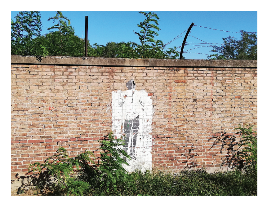
Figure 3. Sani barracks' painted exterior walls.

possibilities for transforming the barracks and to initiate a survey of community needs (Umanità Nova 2020). The owner, CDP, denounced this illegal occupation, which ended with the relocation of XM 24 to another abandoned building in the Bolognina neighborhood.