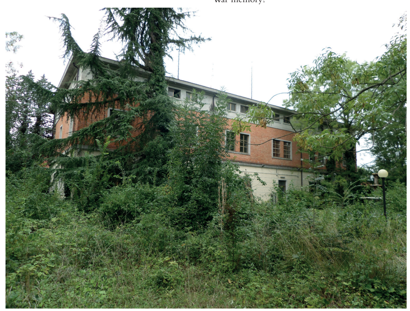
Figure 2: The vegetation has invaded the surroundings of a building

for their inclusion in the programme. In this situation, the actors should not forget that the Trieste Barracks have a testimonial value of the war conflict memory and are a resource in architectural and urban planning terms. In addition, the barracks are totally 'offlimits' for the local community, although they are legally state property — in other words, 'commons'. This intrinsic characteristic would mean that the barracks theoretically belong to all the citizens. Therefore, several questions arise: How much time would it take to transfer the military property to the local level? What kind of function can reuse the barracks and give them back to the community? Could the enclosure be reused without removing the unforgettable Cold War memory?