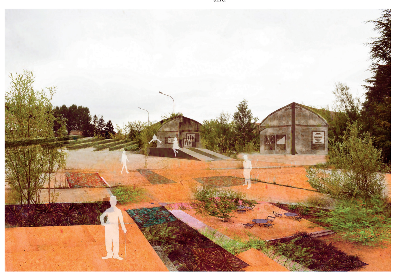
Figure 6: Adaptive reuse of the open spaces present in the former Trieste Barracks according to citizens' requests

The workshop set the former Trieste Barracks as a centre of gravity for transforming the town and its community (see Figures 6–8). The proposals outlined several hypotheses of gradual reappropriation toward the complete reuse of the neglected area. They focused on agriculture, winemaking, culture and