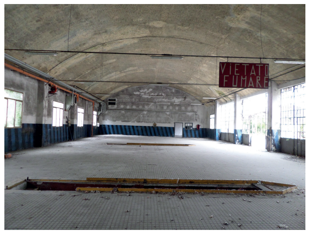
Figure 4: An empty hangar