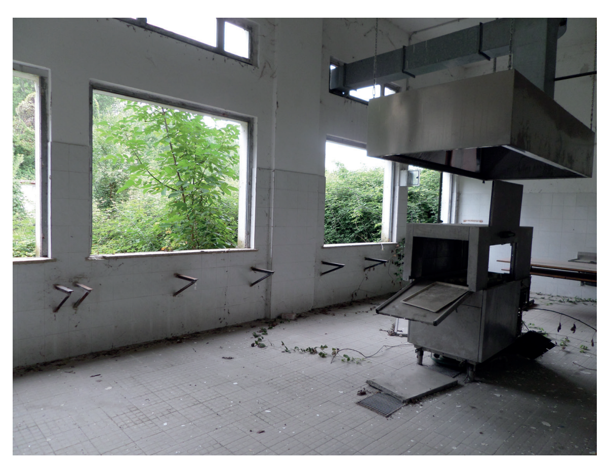
Figure 3: Former kitchen furniture