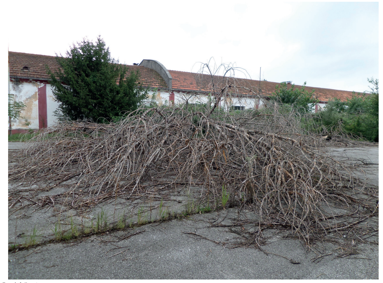
Figure 5: A fallen tree