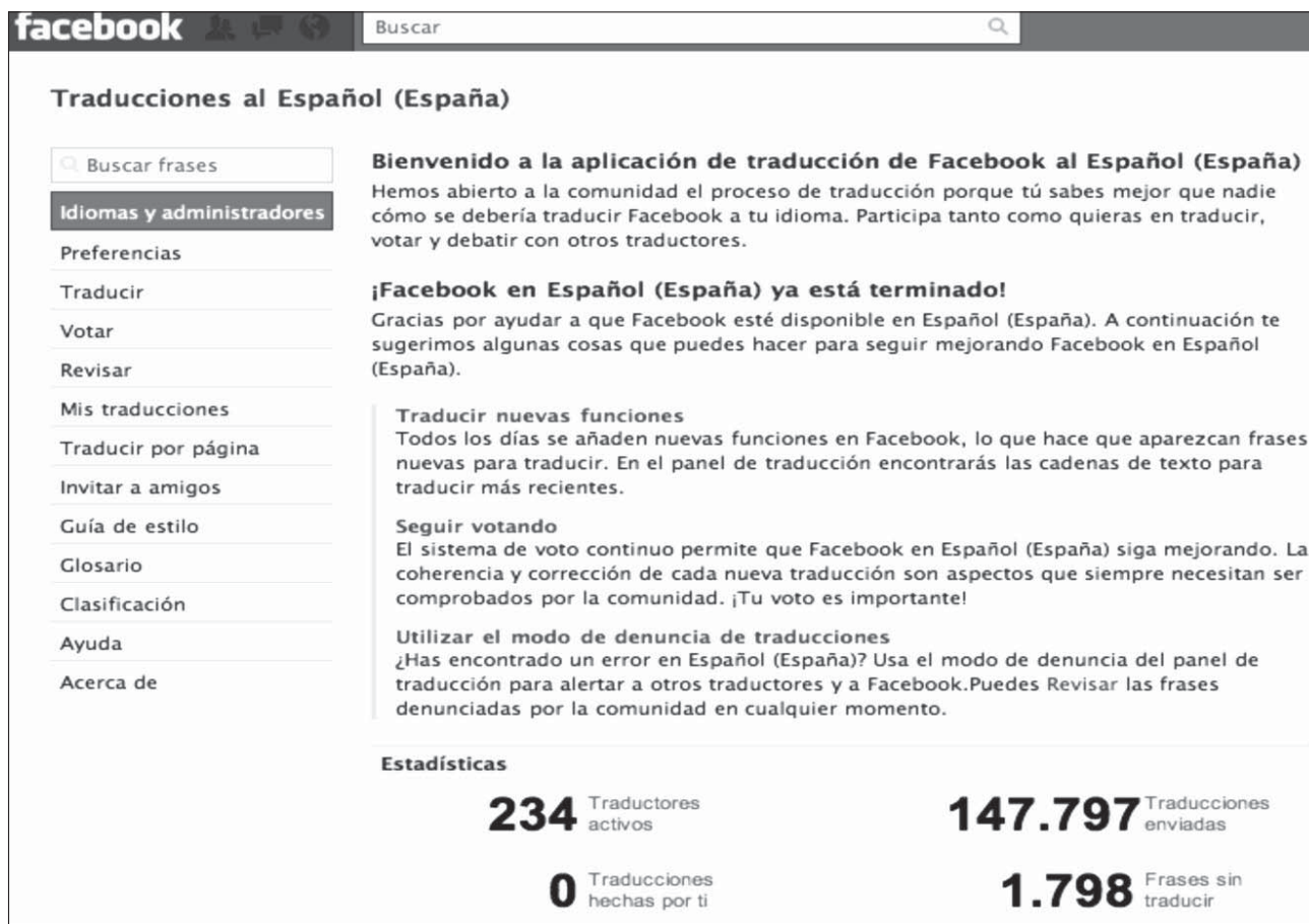
Figure 2: Statistics on the number of translations of Facebook content into Spanish.

The example of Facebook may have influenced other companies to follow suit. In 2009, LinkedIn sent an e-mail to more than 41 million users with a survey asking about their availability and willingness to translate online content on a voluntary basis. This provoked bitter protests from professional translators (Kelly 2009). Similarly, Second Life fans adapted the content of its site into eleven different locales, as three quarters of the registered users are not native speakers of English (Ray 2009). The process undertaken by these sites may serve to illustrate how crowdsourcing is working on the Web and the way in which it can affect the practice and industry of translation.