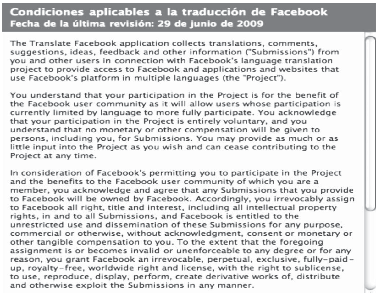
Figure 3: Screenshot of the terms and conditions applied to translations on Facebook ( www.facebook.com/translations ).

It is worth mentioning that there are no published studies exploring the motivation of people who translate on a voluntary basis: as we explained in the previous section, within the category of “collaborative translation” further sections or sub-groups can be established. As for the motivations of the companies, these might be even more difficult to define, since companies listed on the stock exchange such as Facebook should not impose budget constraints in order to avoid designing and implementing the localization of their website and applications into different locales. Following this, it could be hypothesised that other motivations lie behind the idea of crowdsourcing (e.g. using Web 2.0 as a tool intended to supply companies with market surveys and other information, or simply trying to make people use their website as much as possible). However, if the terms and conditions of most crowdsourcing-based activities are studied in detail it seems quite clear that the established policy seems to be rather unprofitable for the users who collaborate as part of the community, as can be observed in the following statement (Figure 3):