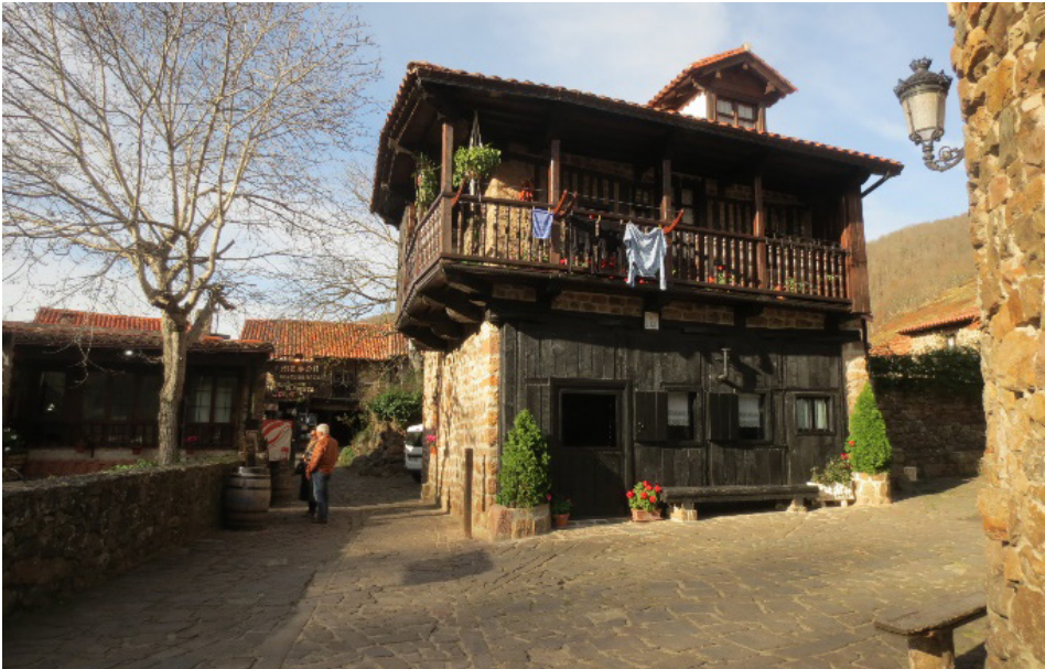
Figure 3. «Ecomuseum Saja-Nansa» (Cantabria). Traditional architecture in the historic-artistic ensemble of Bárcena Mayor in the municipality of Los Tojos

Development and Economic Diversification Operation Programme for Rural Areas (Spanish acronym PRODER), with a varied sample of interventions. Later, other institutions, local bodies, consortiums and associations have also become sponsors, so as to take advantage of the European funding to boost this experience and thus be able to enhance the value of depressed areas with an ample natural and cultural heritage. There are numerous initiatives of different types all over Spain, on both a local and district scale, and with different thematic orientations. Of the cases that focus on a concrete aspect, the following are worth mentioning: the «Ecomuseum of the River Caicena» in Almedinilla (Andalusia), the «Ecomuseum of Bread» in Villanueva de Oscos (Asturias), the «Ecomuseum el Molino de los Ojos» in San Esteban de Gormaz, or the «Ecomuseum of Tordehumos» in Castile & Leon. Among the examples of supra-municipal proposals, worth mentioning are: the «Ecomuseum of Somiedo» in Asturias, the «Ecomuseum of the Pyrenees. Valle del Aragón: Jaca & its rural villages» (Aragón), the «Ecomuseum of Saja-Nansa» and the «Fluviarium Ecomuseum of the Pasiega Mountains & River Valleys» in Liérganes (Cantabria), and the «Ecomuseum of the Valls d’Aneu» or the «Ecomuseum of the River Ebro Delta» (Catalonia).