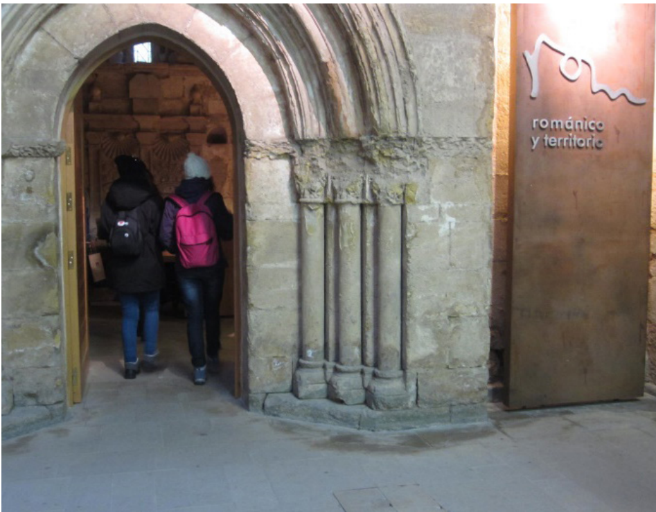
Figure 5. «Northern Romanesque Territory Museum» (Castile & Leon). Exhibition Centre «ROM: Romanesque and Territory» in Aguilar de Campoo (Palencia)

Throughout Spain, there are territories with a denomination close to that of Cultural Park which take advantage of their heritage to offer a singular, cultural-touristic product and thus favour socio-economic development. These include the Fluvial Park of Navàs-Berga (Catalonia), the Cultural Park of Nerpio (Castile-La Mancha) or the Historic Park of Navia (Asturias).