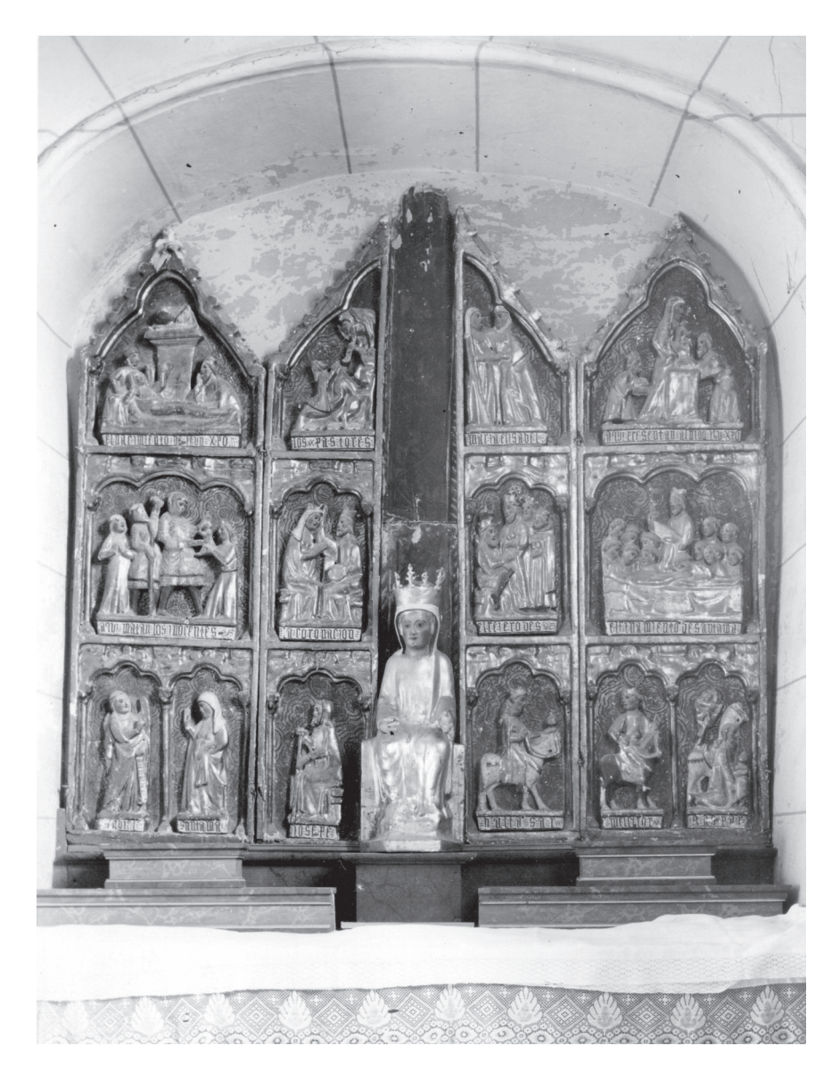
Fig. 2. Yurre/Ihurre (Basque Country, Spain), wings from a Marian tabernacle grouped at a side altar of the church, condition by the mid-twentieth century. The ensemble has been subsequently restored.