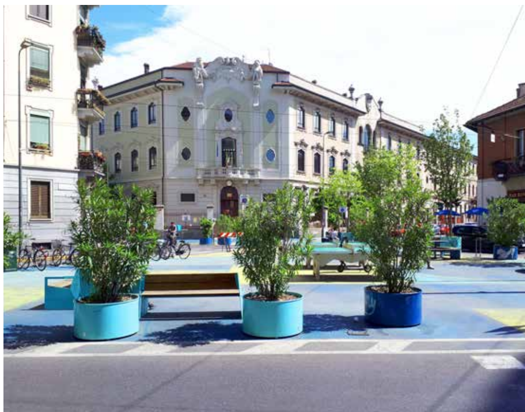
Fig. 4. A new piazza replaces a road junction in via Spoleto using Tactical Urbanism. 2020.