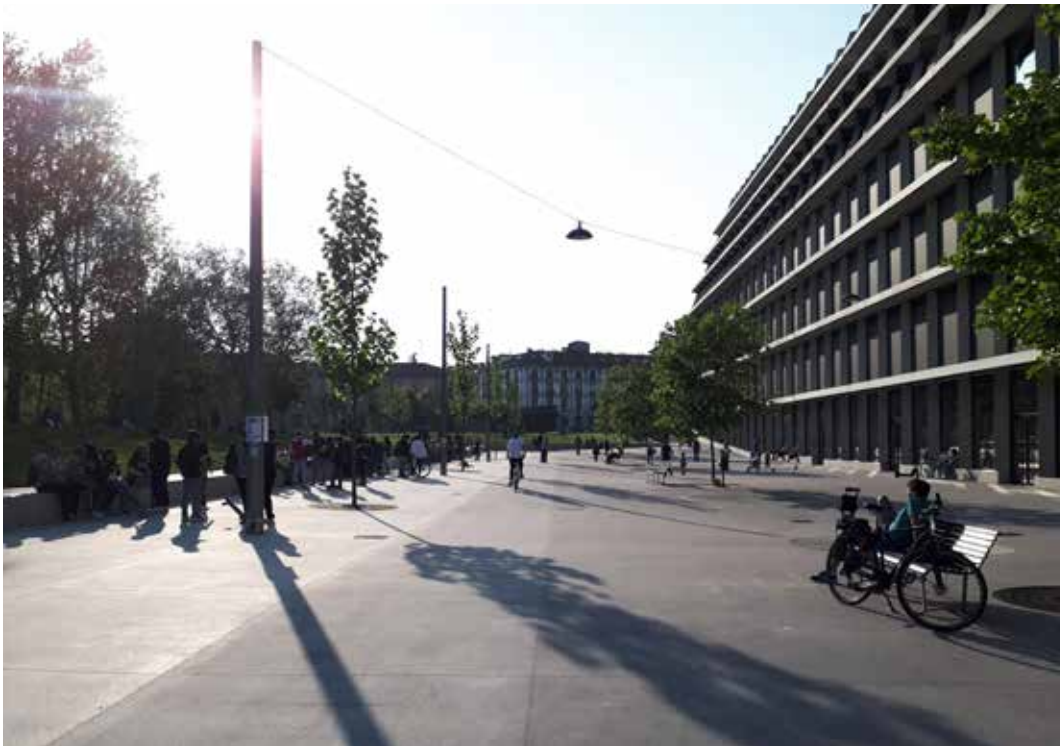
Fig. 1. The public space alongside the new Feltrinelli Foundation headquarters. 2021.