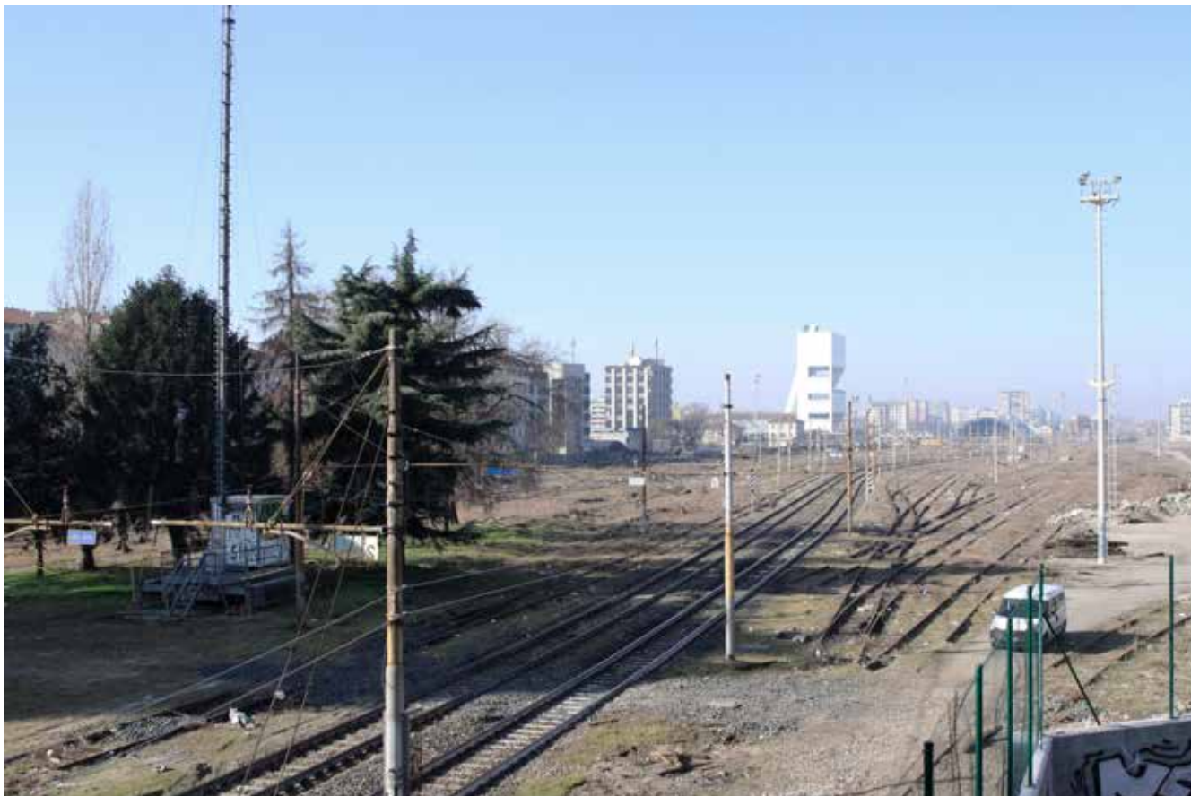
Fig. 3. The Porta Romana railyard, with the Fondazione Prada tower in the background. 2019.