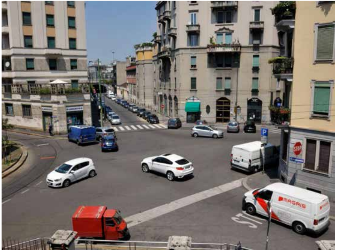
Fig. 4.a The via Spoleto junction before the tactical urbanism intervention. 2015.