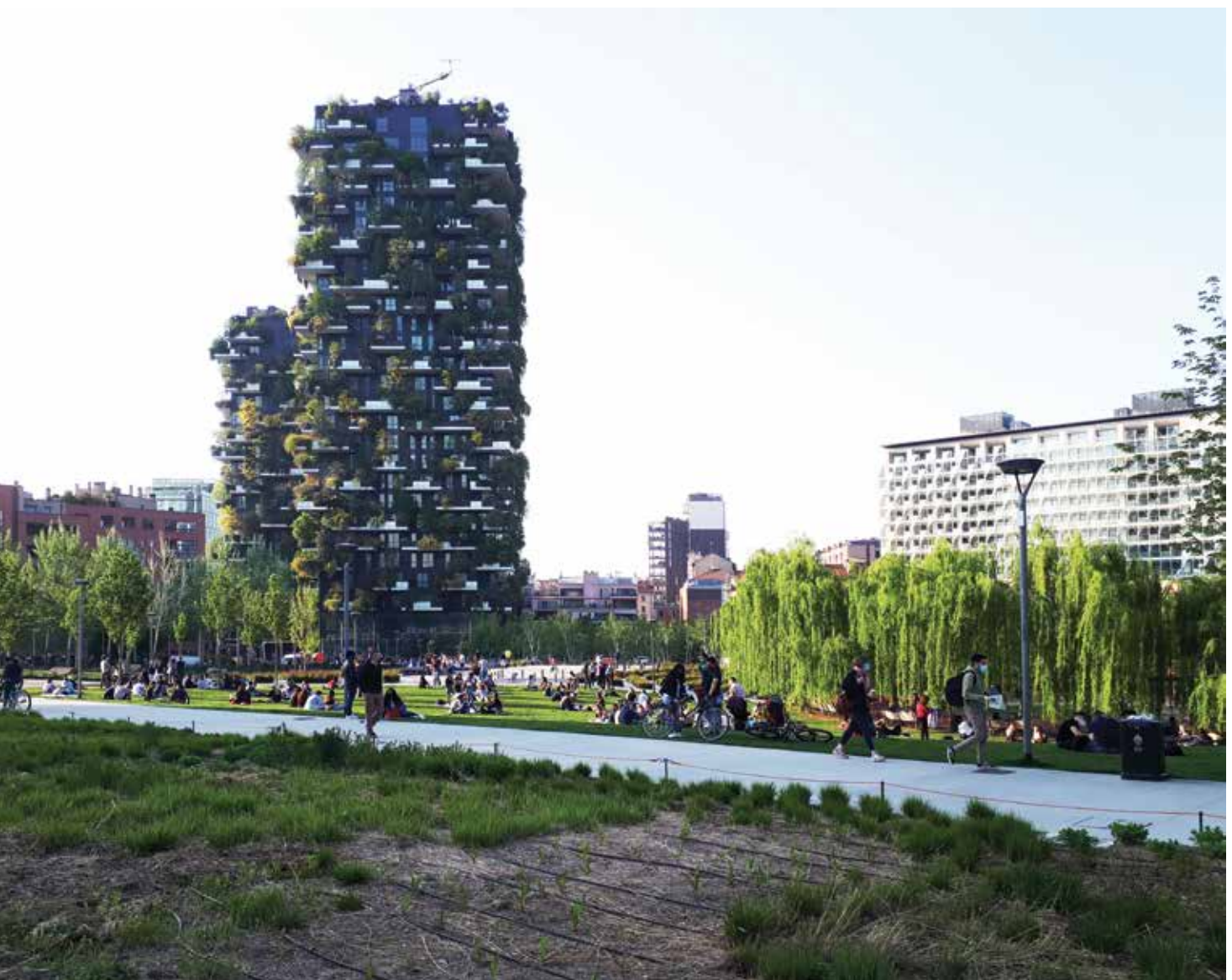
Fig. 2. The Biblioteca Degli Alberi and the Bosco Verticale in the Porta Nuova Area. 2021.