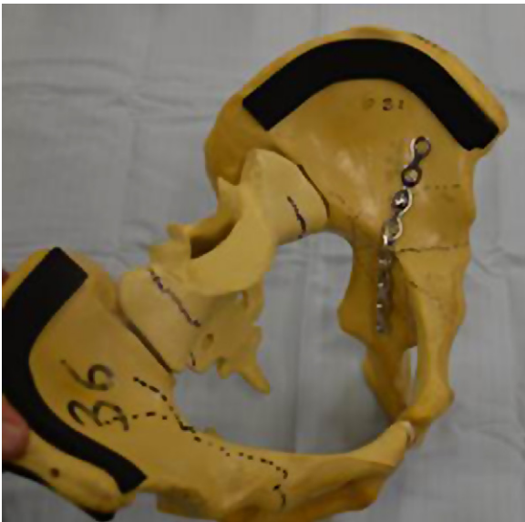
Fig. 1. Image of applied spring plate (3.5 mm 8 hole reconstruction plate) contoured over the pelvic brim buttressing the medial wall on a saw bone. Anchorage is provided to the iliac fossa with cortical screws.