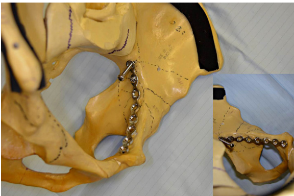
Fig. 2. Infrapectineal plating (3.5 mm 8 hole) contoured below the pelvic brim, through the modified Stoppa approach for fractures involving the quadrilateral plate. Anchorage of the plate is provided with cortical screws above to the sciatic notch.

titanium pelvic brim plate was also successful in preventing medial displacement whereas fixed angle locking plates were found to be unsatisfactory, as the fixed screw trajectory made it almost impossible to place screws periarticularly. 64