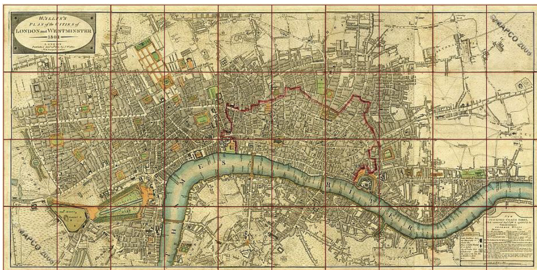
London at 1800