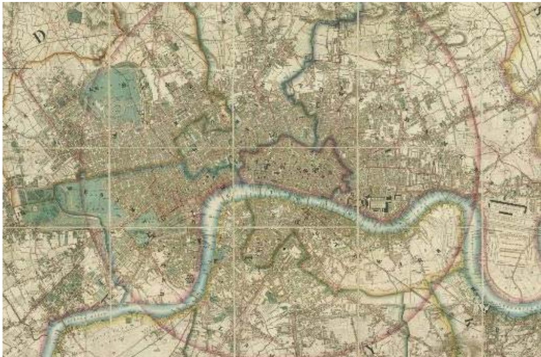
London at 1850