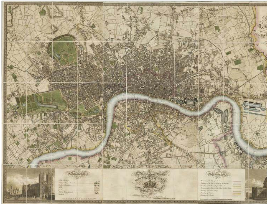
London at 1730