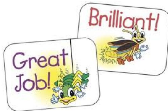
Image 6: “Positive group correction” words that children can use to reward the good work of their partner.