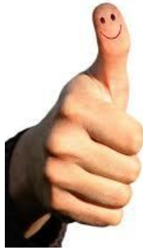
Image 5: “Nonverbal Interaction” to reward something that children have done well.