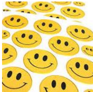
Image 4: “Props” strategy. Stickers to reward positive attitudes or actions.