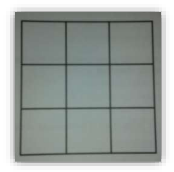
Figure 5. Logical picture

The teacher will help them to identify all polygons hidden in the picture. She will do an example first. When someone thinks he/she has identified a figure, she/he has to colour it with different colours.