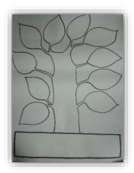
Figure 2. Visual organizer

Then, the flashcards will be face down in the middle of the circle. Using a visual organizer (simulating a word tree) where it will be written a word fruit, vegetables, drink or food. Pupils have to take one flashcard and, depends of the picture, stick the flash card in the correct ''word tree''. There will be four kinds of word trees referring to the last topics, 'vegetables', drink', 'food' and 'fruit'. At the beginning, teacher will do an example where children can observe the dynamic.