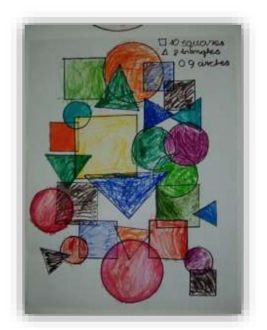
Figure 6. Final task of mixed polygons

In the final task, the way to do the different activities was the same of the other final task; three teams did "How many are there?" and the other two "Logical squares, circles and triangles". Children worked in teams doing it through of the cooperative work. As these activities were especially difficult in some aspects, they could help each other between them and they got a good result. Teacher helped when it was really necessary. The results that pupils did by themselves were excellent and pupils introduced their works successfully. They needed some help but they said the principal content developed; the different polygons that appear in their works, the number of them and sometimes the colours used. Children were able to understand the simple oral language produced by the teacher and they answered in a great way.