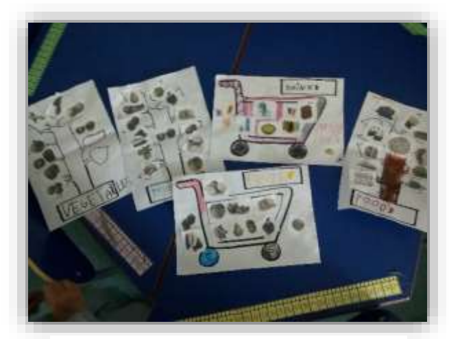
Figure 3. Final pictures

These activities have been developed together in big group in the last lessons, so the final task consists on children will do the activities by themselves. The activities will be 'the market day' or 'word tree'. In this case, there are two different pictures. For 'the market day' the picture will be a shopping cart and for the 'word tree' will be the same visual organizer used in the last session. Each team has different mixed pictures and one word refers to the main topic to classify. Pupils have to classify the pictures that are involved in this word (for example, fruit; they have to stick: apple, orange, lemon, but they do not stick: sandwich, onion, milk).