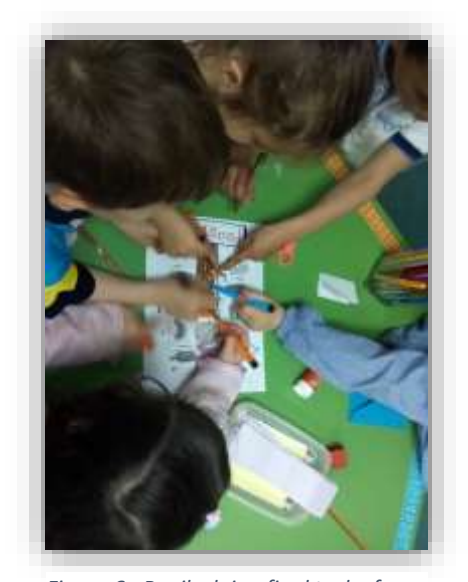
Figure 6.. Pupils doing final task of categorising

In these both sessions the results were very positive, all the pupils understood the main objective according to the thinking skill; they were able to classify the different fruits, vegetables, drinks and foods. And referring to the English content, they recognised the different English words. Sometimes it was necessary using some premises but it is something normal when doing a new activity.