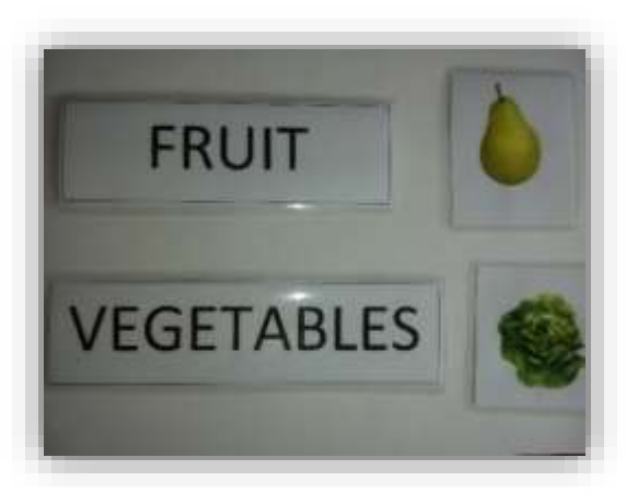
Figure 1. Flashcards

These flashcards will be the same as the ones that appear in the story at the beginning of the lesson. Each pupil has to say if it is a fruit or a vegetables or another different such as drink or food. In that way, pupils categorise the different flashcards. Teacher will help each one 'is this a fruit or a vegetable or another different such as food or drink? Finally everybody will count how many vegetables/fruits are there and in total.