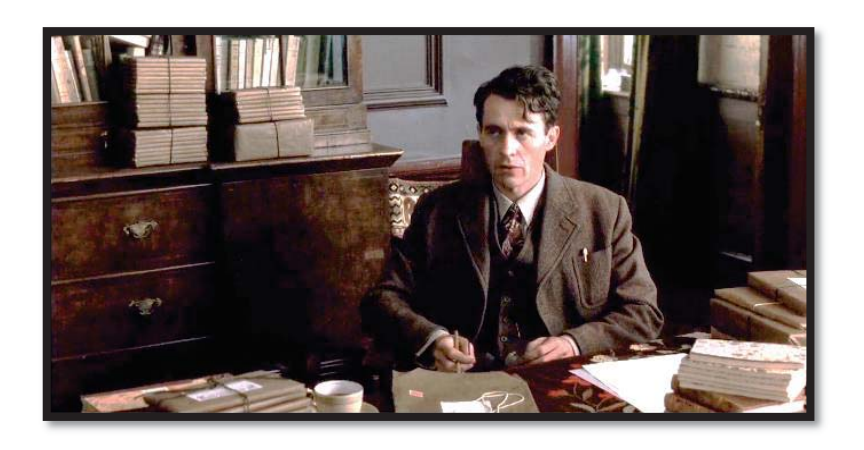
<u>Image 1:</u> Leonard Woolf proofreading scripts in his working desk. (00:09:36)