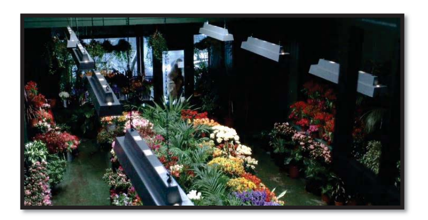
<u>Image 6:</u> The flower shop Clarissa goes to buy flowers for Richard's party. There is a clear contrast between darkness and the vivid colours of the flowers. (00:15:12)