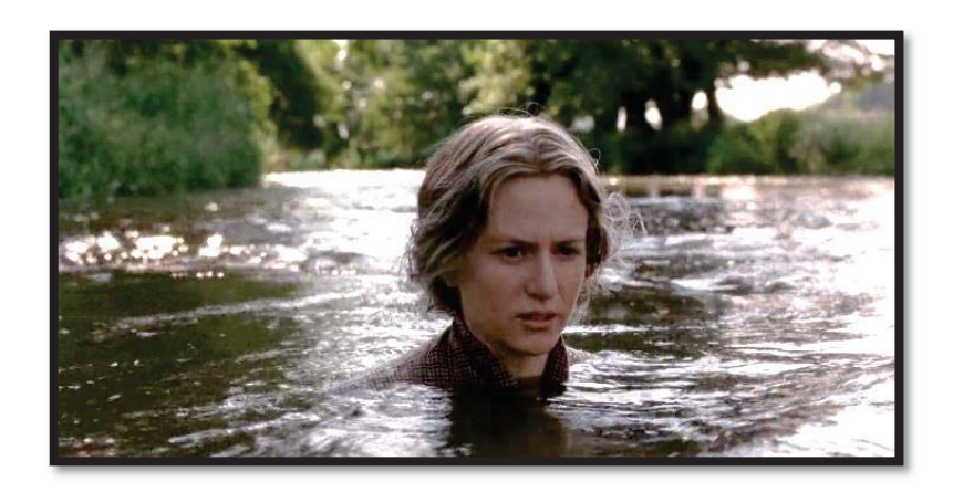
<u>Image 10:</u> Virginia entering the river to commit suicide. (00:03:14)