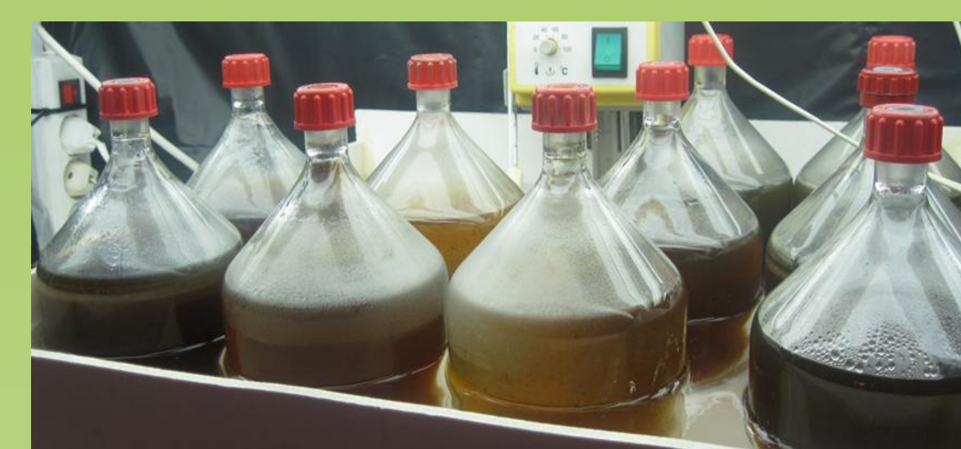
Figure 3. Test evolution in YW