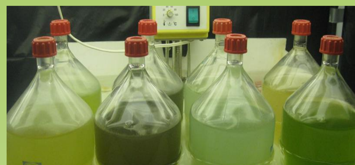
Figure 2. Test evolution in MW

PW showed a fast C and N removals regardless of the dilution applied likely due to its favorable C/N/P ratio (100/18/2) with removal efficiencies in wastewater of 45 and 70 %, respectively. A similar trend was recorded in FW, where its biodegradability occurred rapidly as a result of its favorable pH (7.58), and C/N/P ratio (100/19/1). C and P removals in MW were higher at the lowest wastewater dilutions. Despite its favorable C/N/P ratio (100/20/3), no biodegradation was recorded in 1× likely due to its high initial ammonium concentrations (189 mg NH 4 + /l). A total N removal of up to 80 % was recorded in the 4× tests. A similar biological inhibition to high ammonium concentrations was recorded in YW, where C and N removals increased in 10× compared to 4 ×, and no biodegradation occurred in 1× and 2× tests, whose initial ammonium concentrations were 565 and 271 mg NH 4 + /l, respectively. At the end of the tests the pH values recorded were lower than 10, which supported the fact that neither ammonium nor phosphorus removal took place by stripping or precipitation. The absence of NO 3 - and NO 2 - throughout the tests confirmed that nutrients removal occurred via assimilation into algal-bacterial biomass.