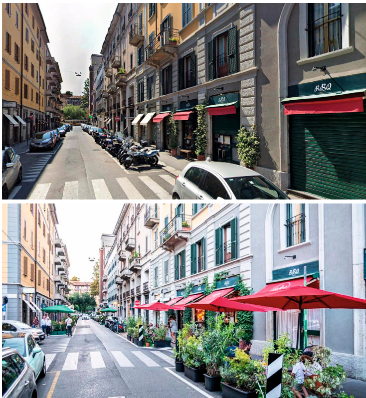
Figure 12. The Tactical Urbanism intervention in Sottocorno Street, Milan, before and after.