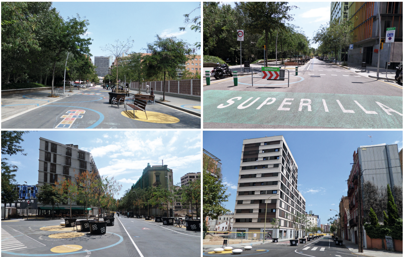
Figures 1-4. Views of the Poblenou's Superblock.

As for the risk of rising real estate values, two concerns arose regarding the possible risk of gentrification. First, the housing cost. 16 It is found that the price per square meter of second-hand houses for sale in El Parc i la Llacuna del Poblenou neighborhood grew from €3,761/m 2 of 2016 to €4,144/m 2 of 2020, thus exceeding the average price of Sant Martí district (from €3,382/m 2 of 2016 to €3.697/m 2 of 2020) and the average prices of Barcelona (from €3,478/m 2 to €4,111/m 2 ). Second, the rent costs, which are only available for the year 2020. 17 In El Parc i la Llacuna del Poblenou the cost €/month is €969,1/month, and the cost €/m 2 /month reaches €14,2/m 2 /month, in the Sant Martí district €954,1/month and €14,0/m 2 /month. Despite the increase of prices, the neighborhood seems to follow real estate market trends unrelated to the application of the Superblock. Moreover, in the Catalan Parliament passed a law regulating rent prices on new housing contracts signed from its approval (September 2020) to guarantee accessibility in sixty Catalan municipalities, including Barcelona. 18