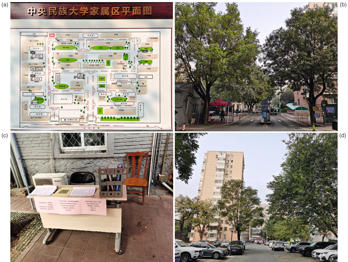
Figures 5-8. Central University Faculty and Staff Community Superblock, Beijing. Planimetry (a), entrance gate (b), COVID-19 checkpoint at the entry (c), and general view (d).

the Superblocks into more “urban” communities re-considering the use of the existing system of open spaces represents a challenging question to planners, architects, and landscapers. Their introverted character may suggest reflecting on the central spaces inside the blocks rather than on the perimeter, by working on the performance of the open spaces. Such kinds of approaches present several advantages, such as they consider different uses according to the seasonality of human activities, are cheap and reversible and promote the pro-active engagement of the community. Regarding this, the notion of “field urbanism” coined by Chow seems not so far from the concepts of Tactical Urbanism, witnessing, despite the evident contextual difference, a cross-boundary convergence of interests in rethinking the existing urban spaces for a healthier and more livable city (Figs. 5-8).