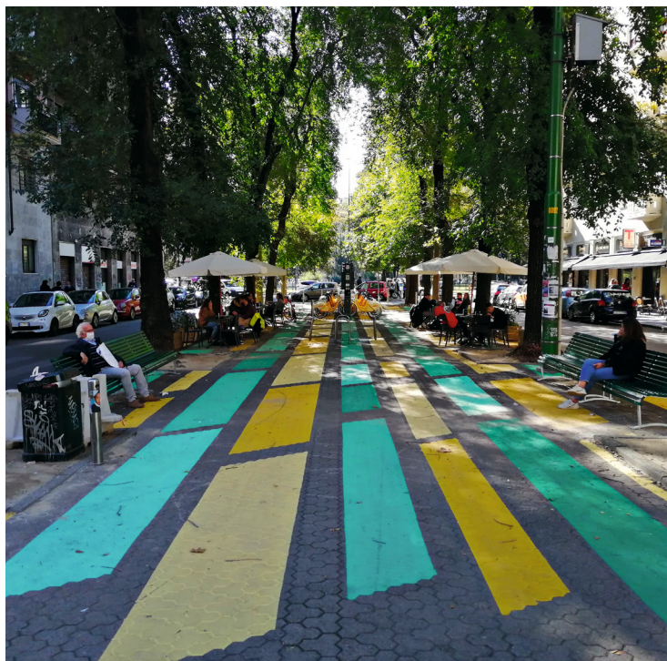
Figure 10. The Tactical Urbanism intervention in Pacini Street, Milan.