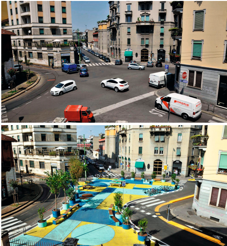
Figure 11. The Tactical Urbanism intervention in Spoleto Street, Milan, before and after.