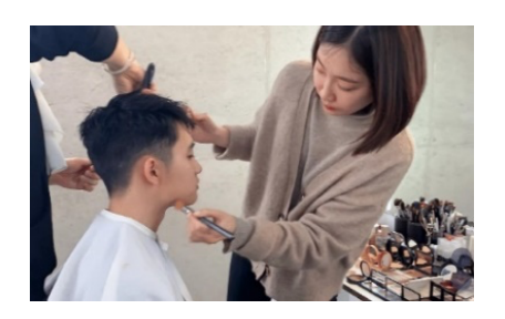
Figure 9. Members of EXO, a famous K-Pop group, getting their makeup done

especially through K-Pop and K-Drama has influence the way general public views masculinity. Before the K-Pop male artist who breakthrough the industry with their unique appearance that involves make-up and fashionable clothes, the masculinity of South Korean male is still rigid and rely on the idea that being masculine have to be owning "muscle", as they are required to go through mandatory military service.