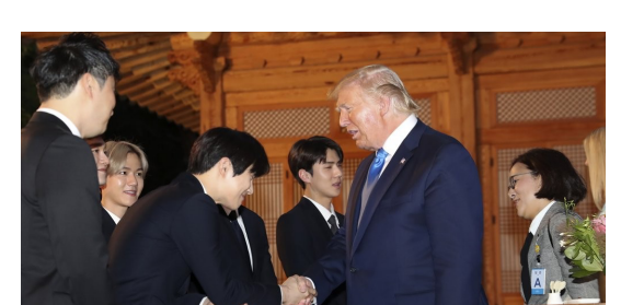
Figure 10. K-Pop Artist in Diplomatic Meetings: EXO in the Blue House Dinner Banquet with Donald Trump.