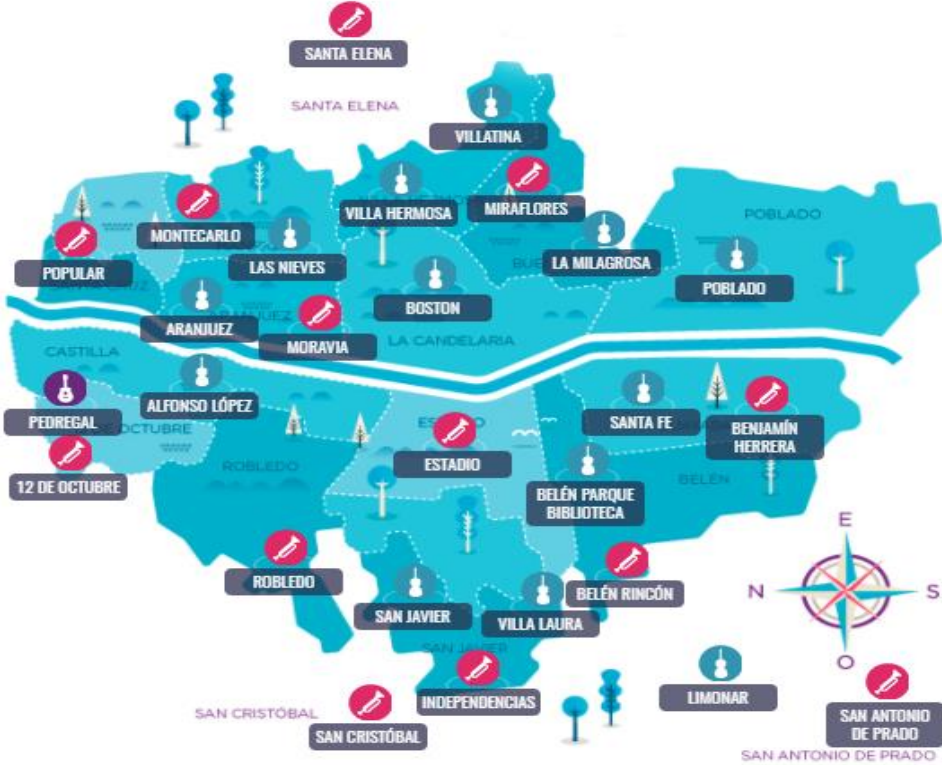
Figure 4. Location in Medellin of the Music Schools in the Network