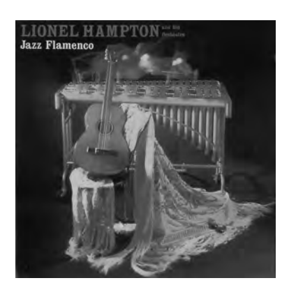
Figure 8.2 Cover of Lionel Hampton's Jazz Flamenco (1957)

Embassy, were held on the 14th and 15th of March, 1956, two weeks before Gillespie inaugurated the intercontinental jazz tours under the auspices of the State Department. Hampton recorded in Madrid an extravagant album entitled Jazz Flamenco , successfully distributed in the United States and in Spain by the RCA-Victor label (Figure 8.2). A Down Beat reviewer wrote that the diplomatic importance of Hampton's tour and recording undoubtedly exceeded the value of the music itself.<sup>3</sup>