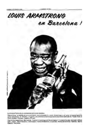
Figure 8.3 Poster announcing the visit of Louis Armstrong to Barcelona, sponsored by Pepsi