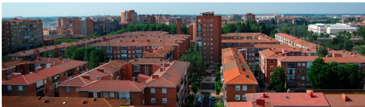
Figure 3. Picture of the Cuatro de Marzo district.

Projected in 1955 at the periphery, “Cuatro de Marzo” district is currently located at the end of the main boulevard of Valladolid. The district is part of 6473 dwellings promoted in Valladolid between 1940 and 1967 by the National Housing Institute (INV) and the Housing Union (OSH). Characterized by a high population density (200 inh./Ha.) and high construction density (100 dw./Ha), buildings are multifamily and multi-property. Also, a residential commonhold exists among all the flat-owners in each building to manage the common parts of the buildings [24].