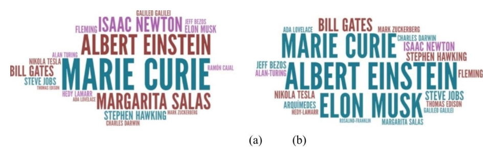
Fig. 1 Famous role models that secondary students know (a) girls (b) boys.

the variables and gender (value below 0.200). However, the highest values were observed among the female gender and the responses "helping others" (0.95) and "improving society" (0.135).