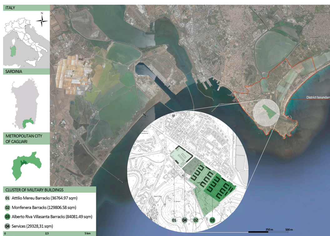
Figure 2. Cluster of military buildings in the city of Cagliari (Author: M. Ladu, 2022).