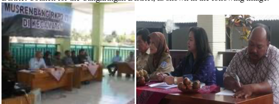
Figure 1. Development Plan Deliberation Situation in Cangkringan District

held on Wednesday, February 4, 2014, at the Pendopo, Cangkringan District. It was attended by all government elements at the district level, including the district head, Cangkringan Sector Police (Polsek), Regional Military Command (Koramil), all village heads in Cangkringan District UPT, schools, PKK, Merapi volcano tour managers, and community leaders. It was also attended by the Provincial Legislative and Sleman Legislative as an invitation, totalling eight members of the Electoral District Council for the Cangkringan District, as shown in the following image.