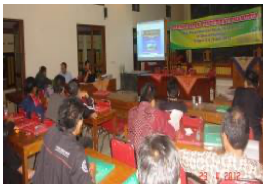
Figure 3. The atmosphere of Tourism Destination Development Training

These training activities involved all tourism stakeholders. The implementation of the training was quite successful because it used an interactive method so that participants were quite enthusiastic in listening to the training materials. The resource persons come from various backgrounds to enrich the participants regarding tourism marketing and institutions. The atmosphere of the training can be seen in the following figure.