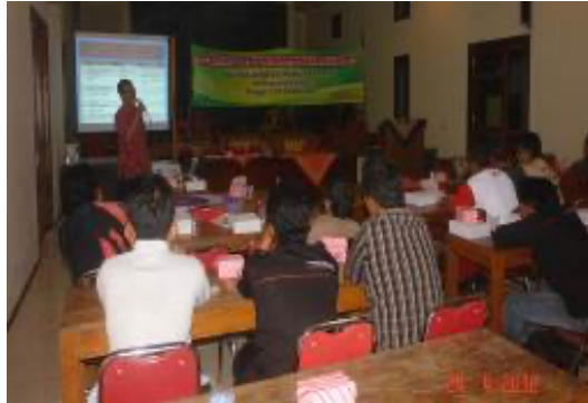
Figure 2. Training for Tourism Actors

Besides holding several pieces of training to increase human resources for tourism business actors, Disbudpar also routinely conducts guidance and supervision. The coaching function is carried out by the staff of Disbudpar once a month by visiting these destinations. Dra. Shavitri Nurmaladewi, MA, the Head of Tourism Development, mentioned as follows: