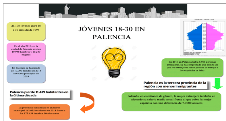
Figure 3. Infographic about young people in Palencia.

There is also a third issue related to the idea of the prototyping laboratory as a multiliterate device that concerns precisely the ability of the working groups and the people who constitute them to use multiple resources and expressive forms or languages, especially for the purpose of being able to disseminate the information contained in the prototypes in various communicative contexts and areas of socialization. And, finally, it is a project that aims to internalize social criteria and values for a digital communication oriented towards the common good, as well as the ethical and democratic use of information and knowledge.