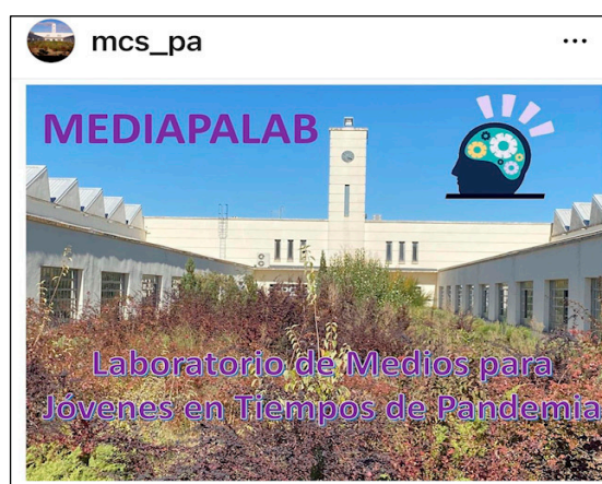
Figure 5. Logo MediaPaLab.

Linked to the competence of digital communication and collaboration, and directly related to the previous task, the students designed a network communication plan whose objective was to disseminate the videos of the laboratories carried out—a plan that, among other strategies, should include an entry on the laboratories' website of their own elaboration ( www.medialabceaex.es , accessed on 10 December 2022). Once the network dissemination plan had been designed, the audience, the communication channels to be used, the strategies, and the timing were specified. Finally, they had to provide evidence of the dissemination carried out on social networks (Figure 5).