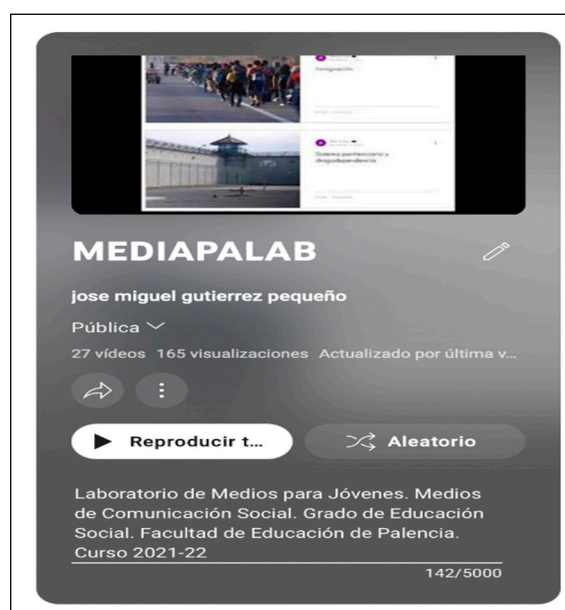
Figure 4. MediaPaLab Chanel.

In relation to the competence on digital content creation, each team had to elaborate a video for the presentation of the social media labs created by the groups. During the process, technical problems were solved in the classroom and the technological needs and answers, innovation, and creative use of technologies necessary for the elaboration of the video were identified. All videos were shared on a YouTube channel (Figure 4).