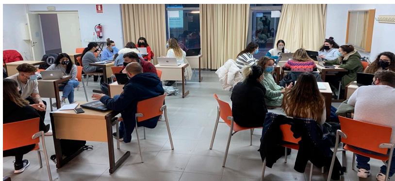
Figure 1. Feedback among teams.

One of the most important characteristics in the prototyping culture is, without a doubt, that it has an experimental character. Therefore, we will seek to build designs that materialize the processes of research, exchange of knowledge, and reflective dialogue previously carried out, subjecting them continuously to collective, public, and contrasted scrutiny in the ecosystem of the laboratory. In the case we are analysing, the students organize and plan the task, starting by defining the objectives and the methodology of each prototype, and exchanging ideas with the rest of the teams in a sharing process in which each prototype receives feedback from the rest of the teams. In this process, each team must suggest improvements to the rest, which are noted down for later analysis in the working groups (Figure 1).