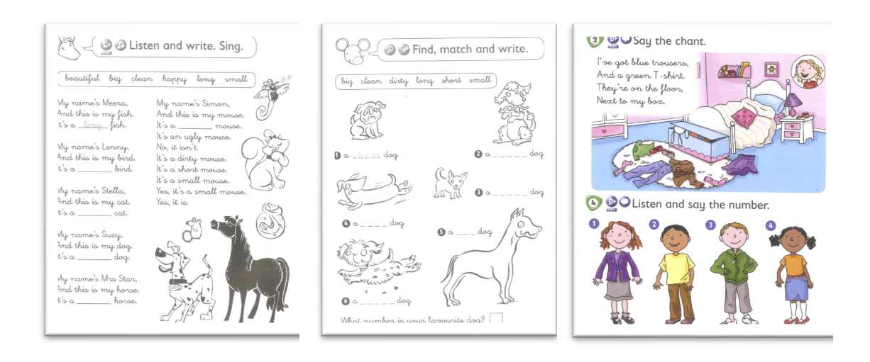
Figure 1. Instances of exercises on ANs in textbooks (Tomlinson & Nixon, 2014)

examples included in figure 1 are taken from the textbooks used by young learners in school contexts like the one of the participants of the present investigation.