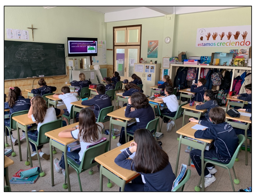
Figure 3. Participants being tested with the AJT

Following the procedure specified in the literature on monolingual and bilingual acquisition, the tasks were conducted on separate days, with one week's time between one task and the next to avoid priming (e.g., Blom & Unsworth, 2010; de Houwer, 1990; Gass & Mackey, 2015; McDaniel et al., 1996; Rice et al., 1999; Slobin, 1985; Thornton, 1998). Furthermore, the two tasks were implemented in groups as part of the normal activities within the classroom sessions, in a setting of absolute normalcy, and by means of Power Point presentations that included appealing and funny pictures whenever possible (see figure 3). The participants' answers were registered in answer sheets for each of the tasks which were provided during the group sessions.