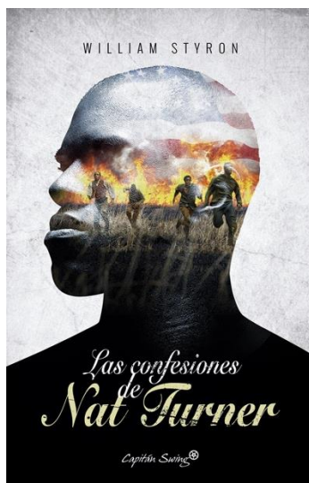
Fig. 2. Front cover. Bosch, Andrés, translator. Las Confesiones de Nat Turner By William Styron, Capitán Swing, 2016.

images could appeal to readers who are looking for a historical novel that criticizes institutional power.