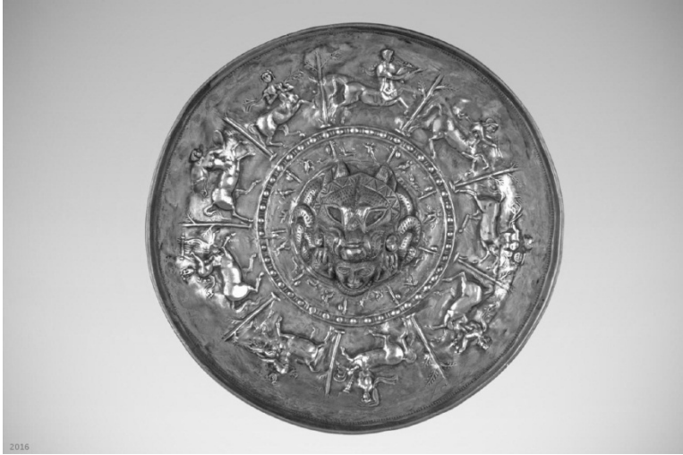
Fig. 8-4: Patera of Perotito (Museo Arqueológico Nacional, Madrid. Photo: Antonio Trigo Arnall).

One of the most abundant types of such vases, after Red-Figure cups, are the Attic Bell Kraters. These vases, different kinds of attic vases with red and black figures, were made in Greece especially to supply the Iberian market. The quality of the vases and their depictions is inferior to the products that are found in Greece and other areas, but Iberian elites were eager to accept these products. According to Carmen Sánchez, 88 the majority of bell-kraters found in the area of Andalusia depict Dionysian and Symposion scenes, followed, but in very low numbers, by Amazonomachiai (Amazon battles) and Gryphomachiai (battles with griffins) and a very scant scattering of mythological subjects. Iberian elites seem to have chosen kraters with specific scenes which are mainly Dionysiac (50%) and symposions with musical scenes (30%). All in all, 80% of the vases that they were importing show musical scenes. The scenes lack of narrative intention and the characters are commonly unrecognisable, with ambiguous attributes. 89 They are more likely representing atmospheres of festivity, maybe subscribing to the image that Iberians held of their afterlife. 90