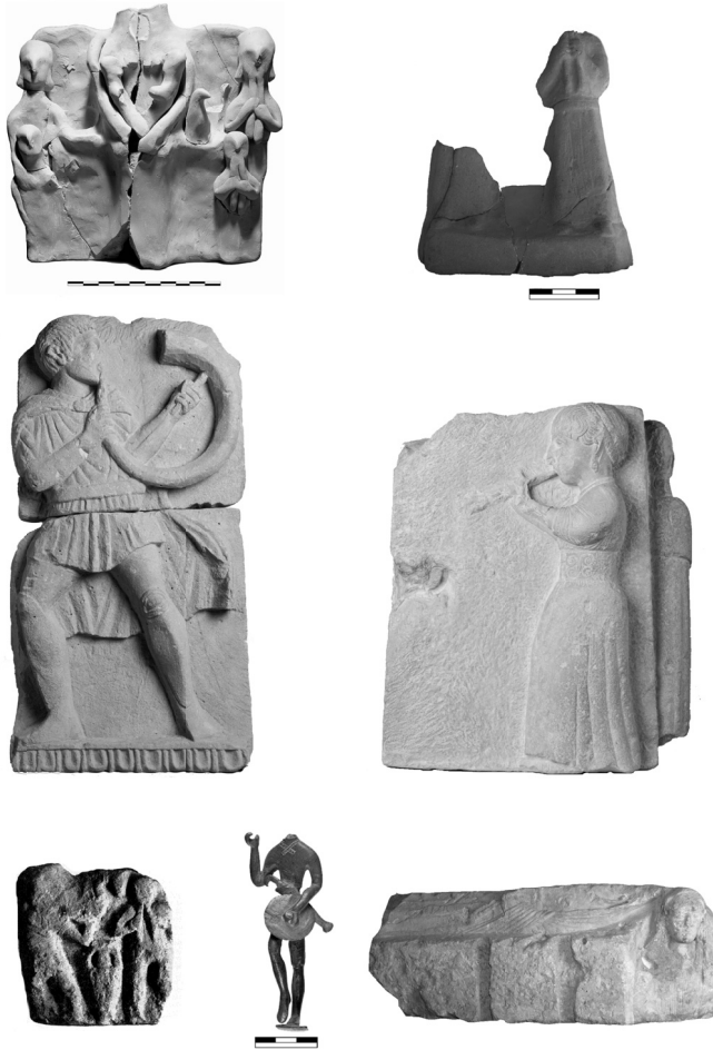
Fig. 8-3 (from left to right and from top to bottom): a. Plaque of la Serreta (Photo: Crespo Colomer. Archive: Museu Arqueològic Camil Visedo Moltó, Alcoi, Alicante); b. Terracotta from El Cigarralejo (Photo: Museo de Arte Ibérico de El Cigarralejo, Mula, Murcia); c. Funerary Monument of Osuna B (Museo Arqueológico Nacional, Madrid. Photo: Foto: Fernando Velasco Mora); d. Funerary Monument of Osuna A (Museo Arqueológico Nacional, Madrid. Photo: Foto: Fernando Velasco Mora); e. Funerary box of Torredonjimeno (after García Serrano 1968: 234, fig. 1); f. Bronze of El Collado de los Jardines (Museo Arqueológico Nacional, Madrid. Photo: Arantxa Boyero Lirón. N.I. 29234); g. Funerary Monument of L'Horta Major (Photo: Crespo Colomer. Archive: Museu Arqueològic Camil Visedo Moltó, Alcoi, Alicante).