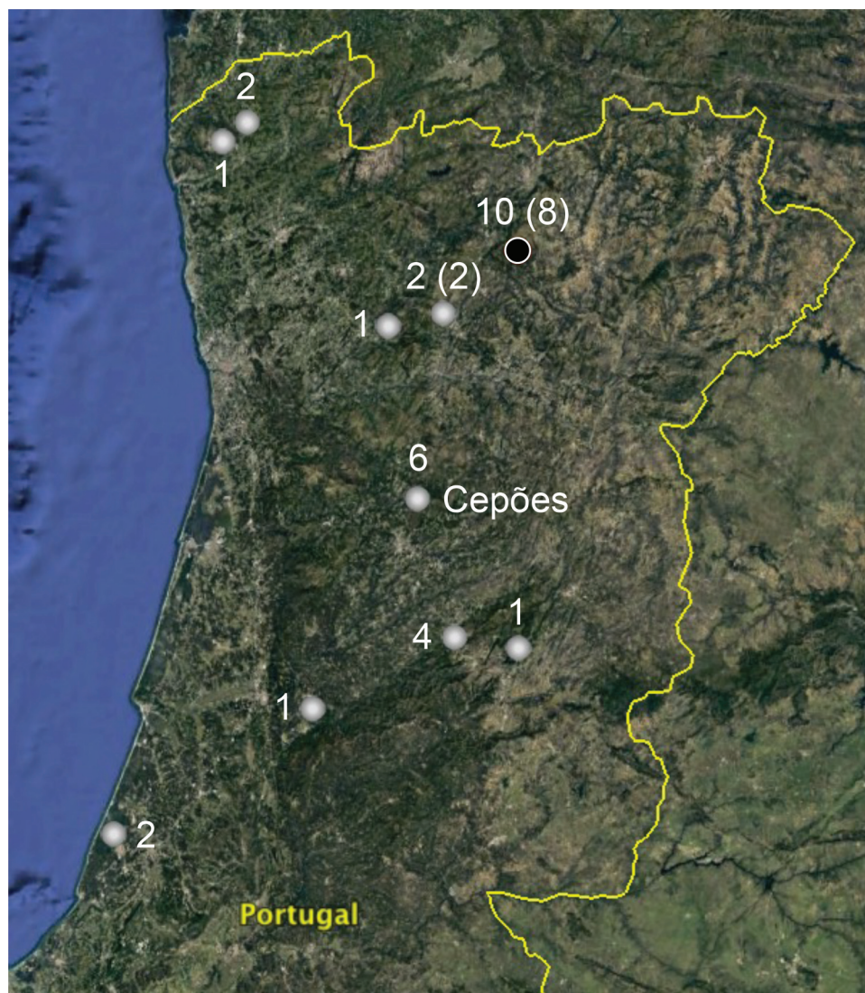
Fig. 1. Study sites location in Portugal and respective number of observations. Numbers in parentheses indicate the number of fires, whenever it is >1. Shaded dots correspond to wildfire locations; the black dot corresponds to experimental fires (plus one wildfire observation). [Colour version available online.]

perimeter, and tree height were used as putative independent variables. Untreated plots were assigned a fuel age of 25 years, the approximate age of the stand. The splitting process inherent to regression tree analysis was carried out until the Akaike's information criterion corrected for small samples (AICc) was minimized. The influence of each variable on SHR and h_c was evaluated by its relative contribution (%) to the total amount of variability explained by the model.