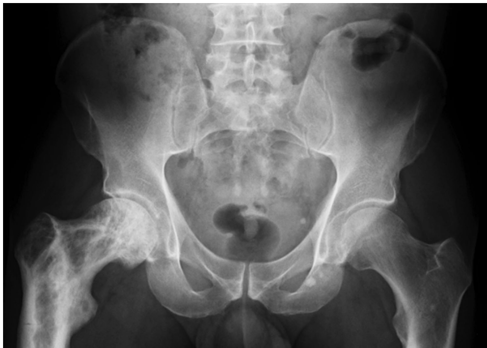
Fig. 1. X-ray features of PDB. Pelvic radiograph from a patient with PDB affecting the upper right femur showing alternating areas of osteolysis and osteosclerosis in the greater and lesser trochanters and femoral neck; loss of distinction between the cortex and medulla in the upper femur; bone expansion and deformity of the affected femur; and a pseudofracture on the lateral aspect of the femur opposite the lesser trochanter.