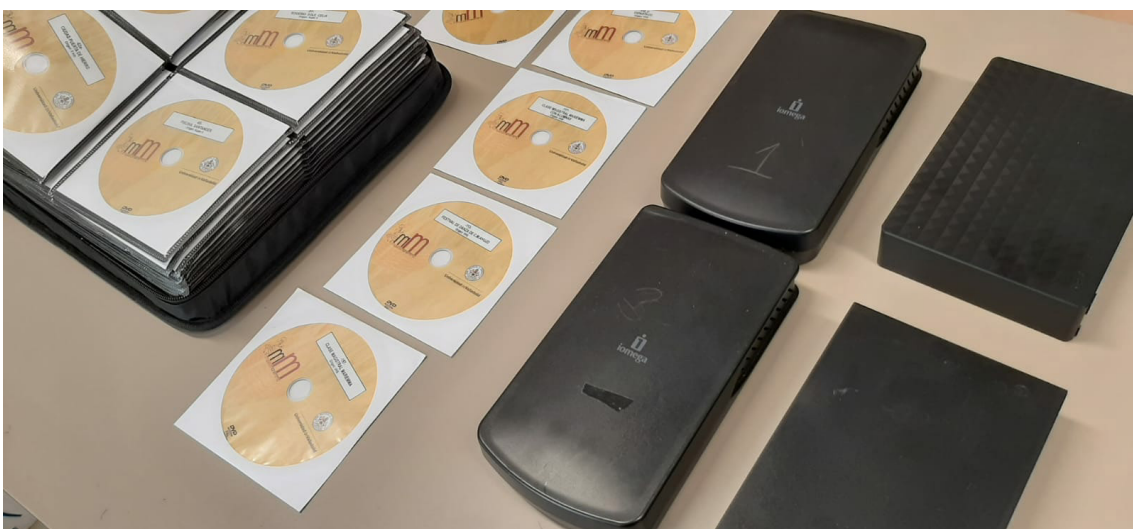
Figure 2. DVD collection and hard disks

The digitized files were stored on different types of media. One copy was stored in a high-quality DVD collection, as a long-term preservation element. A second copy was inserted in redundant hard disks (duplicated) for permanent or sporadic access, and a further copy was also inserted in hard disks but stored at the University of Valladolid, 44 km. away from the town of Íscar, as it is advised by the guidelines in case of natural disasters (IASA, 2009, p. 145).