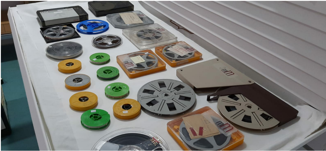
Figure 1. Film analog media, several sizes