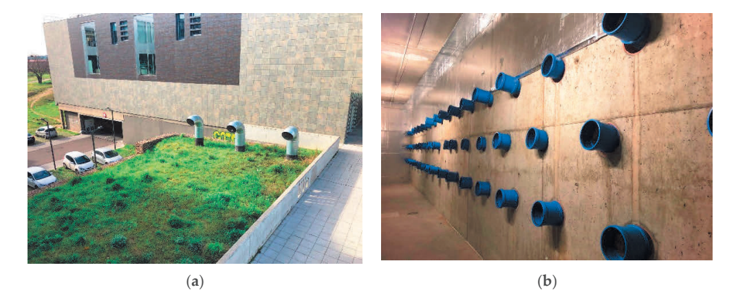
Figure 1. Earth-to-air heat exchanger at the LUCIA building: (a) outside; (b) inside.