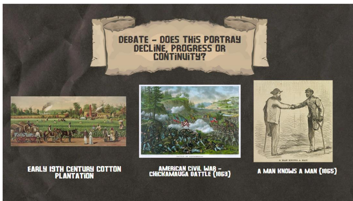
Figure 3. Task 3, Session 5

He wanted to stoke the intensity of the bonfire but he couldn't throw large objects that would increase the flames. Something started to seem familiar to him, he started recognizing the environment, and suddenly everything made sense, his home was completely burnt to the ground. He started running, crying again and stopped next to a woman's dead body. He started making indescribable noises, like a mad animal. The boy was deaf-mute.