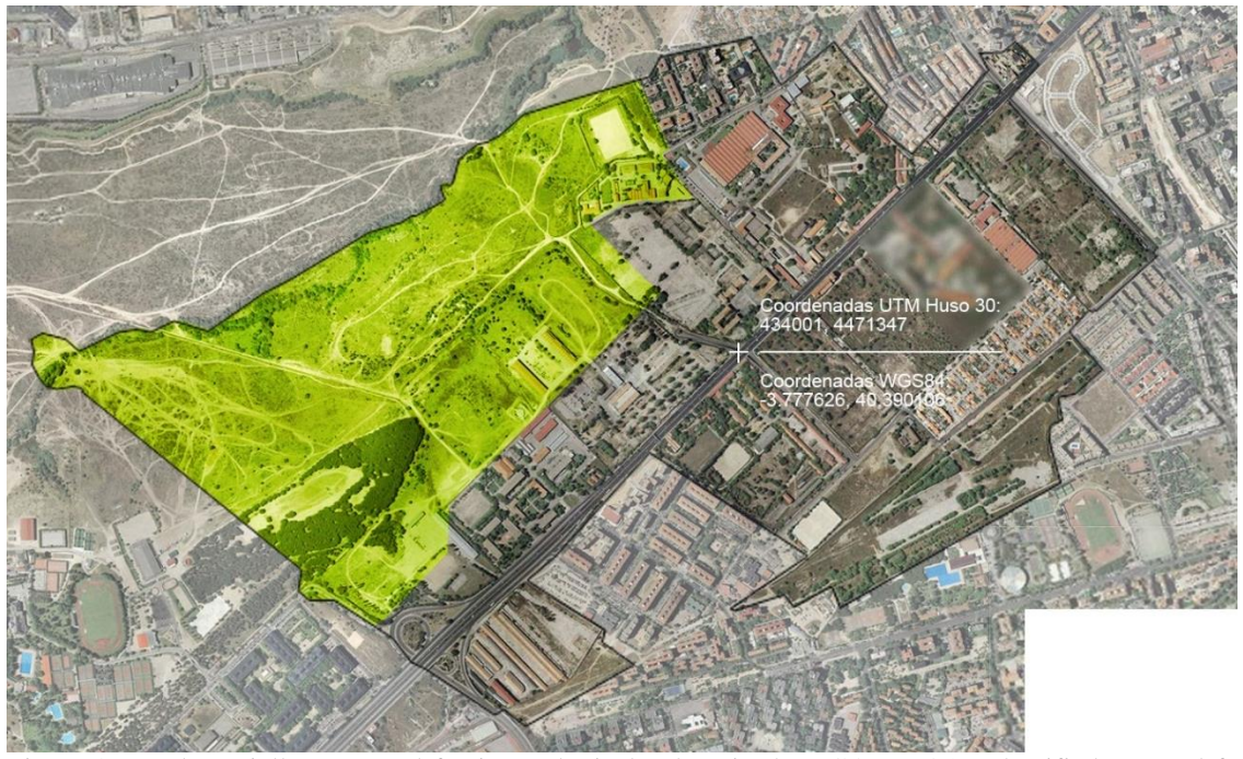
Figure 2. Land specially Protected for its ecological values in the PGOUM-85 reclassified as Land for Development in the PGOUM-97 in the "Military installations of Campamento" area.

the Supreme Court's partial cassation of 2007 and final sentence of 2012 eventually cancelled 17 real estate developments covering approximately 3033.88 ha of land. This fact did not stop the expansive model of Madrid, but quite the opposite. In 2013, the City Council provisionally approved the so-called "Partial Revision of the PGOUM-85 and the Modification of the PGOUM-97 for the areas affected by the Superior Court of Justice of Madrid's enforcement of judgments of 27 February 2003 and the judgments of the Supreme Court's ones of 3 July 2007 and 28 September 2012". This document classified these 17 pieces of land for new development without altering the number of dwellings planned 16 years earlier.