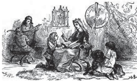
Fig 2. Women during the Middle Ages (Joax, 2008).

which the power of aristocratic women grew, and women were put in a better place of the panorama although ordinary women still remained in a lower position.