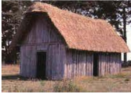
Fig 4. Peasant's home (Trueman, 2013).