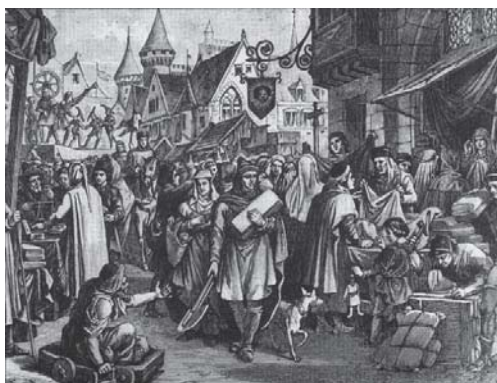
Fig 3. Trade (Opperman, 2013).

so they started to demand their own control and English merchants achieved this right in the 14 th century: “They gained royal charters that allowed them to set up monopolistic centers on the Continent, called staples, as centers of activity” as Lehmborg said in his work (2002: 124).