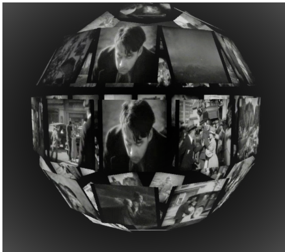
Figure 2: The sphere with the frames/icons

The order of distribution of frames is random, creating unique environments at each startup of the installation. After the initialization and calibration of the coordinate system, the visitor can walk around the room and explore the sound of the environment, and at any time the visitor can close the fists to control the imaginary steering wheel, starting the orbit in the sphere.