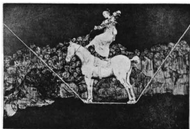
27. Goya, "Fiero monstruo!", Desastres , plate 81, ca. 1810-20 (1820 ?; unpublished with original set).—28. Covarrubias, "Repetit, Quod Nuper Omisit", Emblemas Morales , n.º 92.—29. Goya, "Se defiende bien", Desastres , plate 78.—30. Covarrubias, "Nulla Nisi Ardua Virtus", Emblemas Morales , n.º 125.—31. Goya, "Que se rompe la cuerda", Desastres , plate 77.—32. Goya, "Disparate nuptial", Desastres , plate 79 (2).