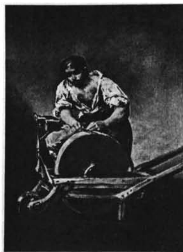
15. Goya, "Hasta la Muerte", Caprichos , plate 55.—16. Covarrubias, "Nulli, Non Sua Forma Placet", Emblemas Morales , n.º 98.—17. Goya, Les Vieilles , ca. 1810. Lille, Musée de l'Art.—18. Covarrubias, "Fallit Volatilis Aetas", Emblemas Morales , n.º 208.—19. Covarrubias, "Consideravit Se Ipsum & Abiit", Emblemas Morales , n.º 182.—20. Goya, The Knife-Grinder , ca. 1810.