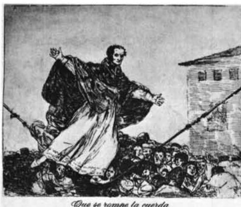
Que se rompe la cuerda