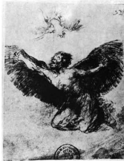
33. Goya, "Disparate de bestia", Disparates , plate 19 (?; unpublished with original set).—34. Covarrubias, "Molem Superit Ingenium", Emblemas Morales , n.º 161.—35. Goya, "Modo de volar", Disparates , plate 13.—36. Covarrubias, "Ingenium Mala Saepe Movent", Emblemas Morales , n.º 285.—37. Goya, "Daedalus and Icarus (?)", Album H, ca. 1824-8, Prado.