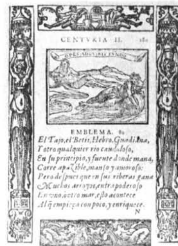
21. Covarrubias, "Aunque Gaste Los Aceros", Emblemas Morales , n.º 119.—22. Goya, The Anvil , ca. 1810. The Budapest Museum of Art.—23. Covarrubias, "No Por Eso Pierde Su Valor Y Peso", Emblemas Morales , n.º 194.—24. Goya, The Water-Carrier , ca. 1810. Budapest, Museum of Art.—25. Goya, "Lástima que no te ocupes con otra cosa", Album C, ca. 1814-23, Prado.—26. Covarrubias, "Opes Adquirit Eundo", Emblemas Morales , n.º 180.