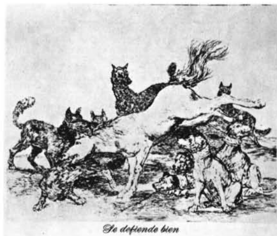
Se defiende bien