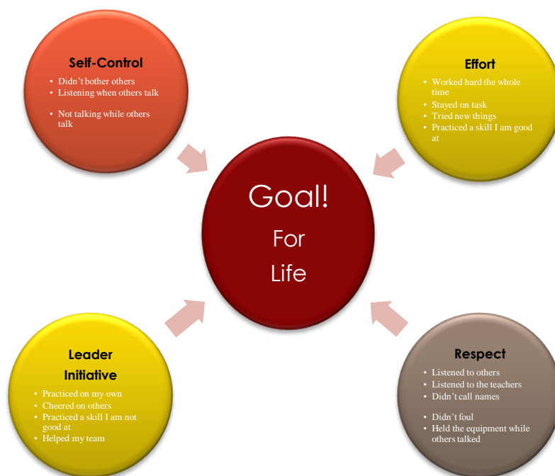
Figure 1. Modified TPSR Design

The second curriculum of sport and fitness was taught in nine week units and included dance/team handball, basketball/fitness/weights, and soccer/fitness/weight training (sport skills on Tuesdays and fitness on Thursdays). These options were chosen by the students from a list offered to them at the beginning of the year and were geared towards teamwork, tactics, and game play. Competence was increased through the teaching fitness concepts and game skills were taught in reference to tactics and game play. Autonomy was maximized through instructional strategies providing increased opportunities for the youth to design and structure their practice time as the unit progressed. These opportunities included players assuming responsibility and commitment to the program by helping to create norms and rules, and assuming leadership positions during practices such as coaches, trainers, captains, etc. Relatedness was fostered by breaking the class up into small groups of four or five students, so that the instructors could interact each day with each student in friendly open manner. The instructors purposely set out to get to know the students and provide feedback consistently to the same students. This teaching was based on small group interactions allowing for choices by the students and instructors as to what tactics and skills to work on, what plays to practice, and the ratio of practice to game play.