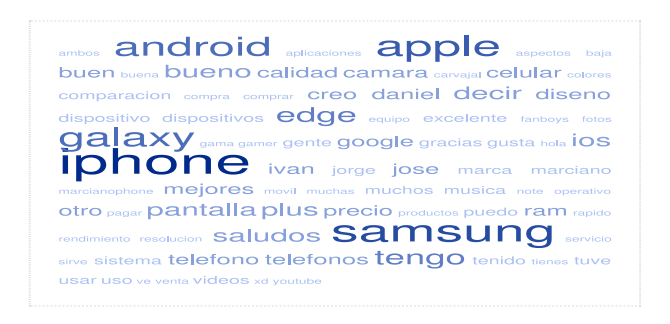
Figure 2. Most frequent mentions

evaluation, that is Android and Apple phones. As for references to the objects, participants used the following expressions: iPhone (134 tokens), samsung (96 tokens), apple (69 tokens), android (63 tokens), galaxy (48 tokens), edge (31 tokens), as is systematised in Figure 2: