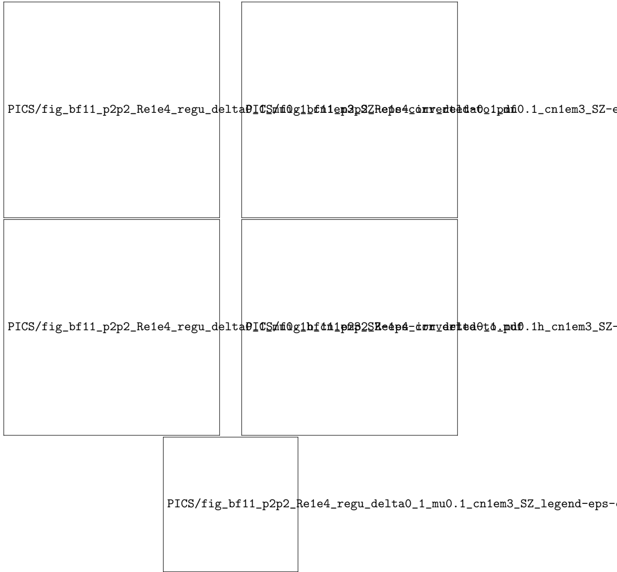
Figure 2: LPS with global grad-div stabilization, P_2/P_2 pair of finite element spaces, Grid 1 (left) and Grid 2 (right), dotted line: slope for second order convergence.

iteration). Since the matrix representing the fluctuations of the gradient possesses a wider stencil than all other matrices for the velocity-velocity coupling, we put the term with the fluctuations of the velocity gradient on the right-hand side in the Picard iteration. In order to achieve a satisfying rate of convergence of this iteration, numerical tests showed that the parameters \{\tau_{\nu,K}\} should be rather small. In addition, we could see that increasing these parameters above a certain value leads to a notable increase of the errors. Altogether, for the irregular Grid 2, \tau_{\nu,K} = 0.01h_K turned out to be an appropriate choice. In view of condition (??), the LPS parameters for the pressure were chosen to be \tau_{p,K} = 10^{-4}h_K .