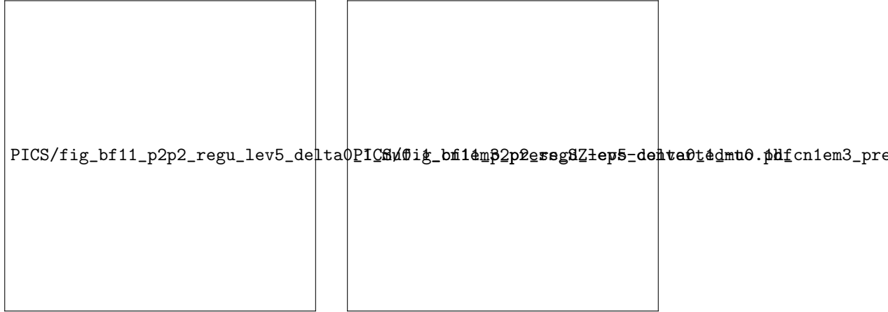
Figure 4: LPS with global grad-div stabilization, P_2/P_2 pair of finite element spaces, Grid 1, behavior of errors with respect to \nu^{-1} , same legend as in Figure ??.