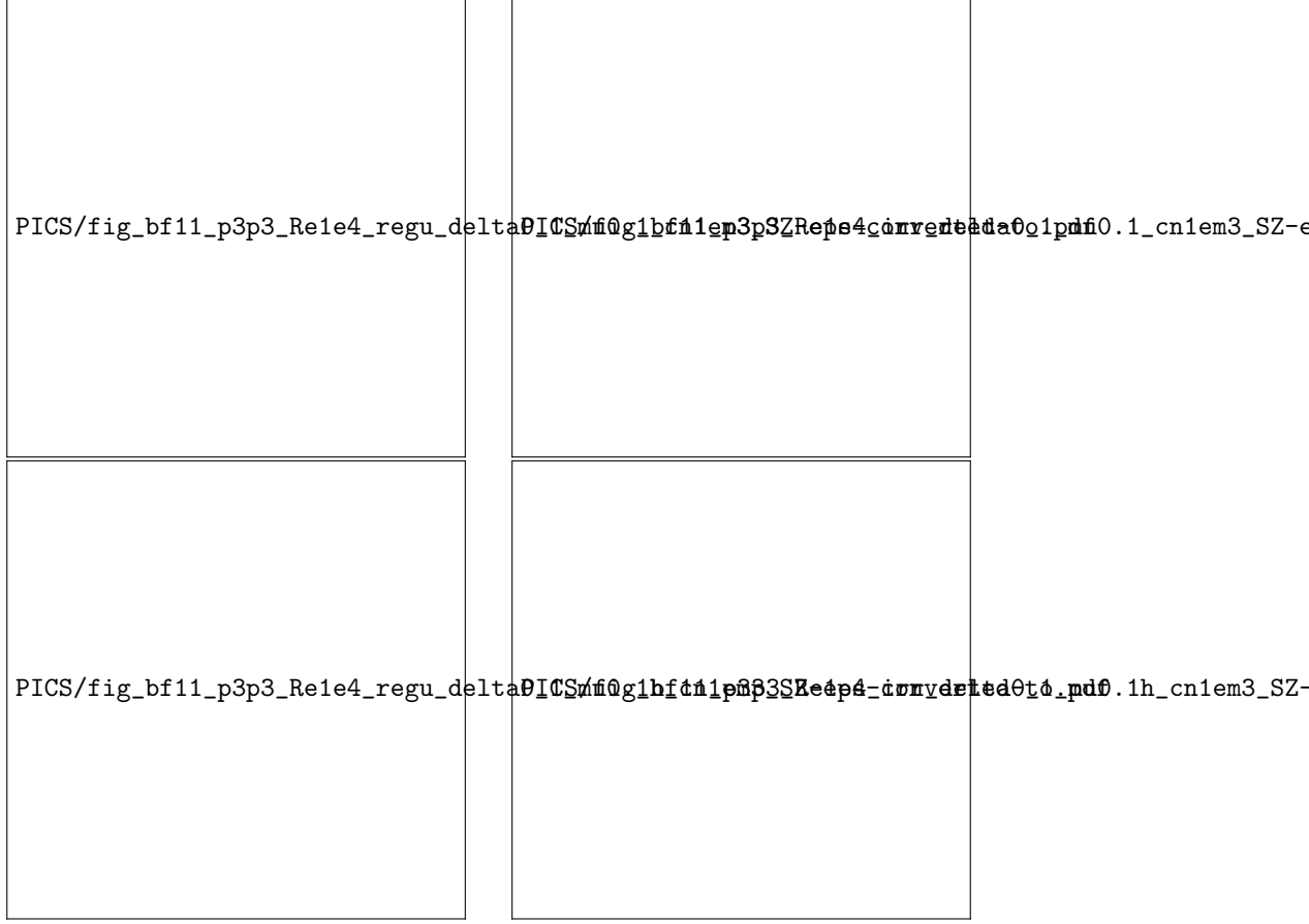
Figure 3: LPS with global grad-div stabilization, P_3/P_3 pair of finite element spaces, Grid 1 (left) and Grid 2 (right), dotted line: slope for third order convergence, same legend as in Figure ??.

An error bound for the considered method was derived in Theorem ?. In the numerical simulations, the terms with the fluctuations on the left-hand side of (??) were approximated by