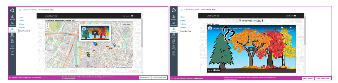
Figure 2: Screenshots of Smart GamiTool in Canvas LMS: (a) student interface with gamified and physically-located activities about deciduous trees, and (b) student interface with the same activities in the virtual space (students without nearby entities).