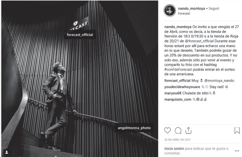
Figure 3: Publication that reinforces the location