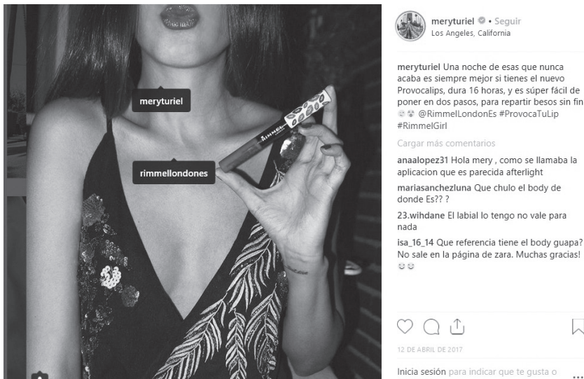
Figure 4: Repeated mention to a brand that suggests a professional relationship between the parties