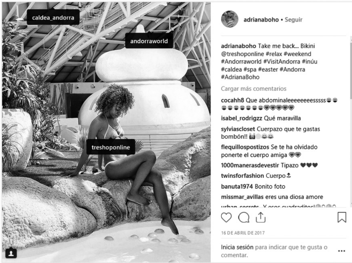
Figure 2: Photography with labels that identify brands