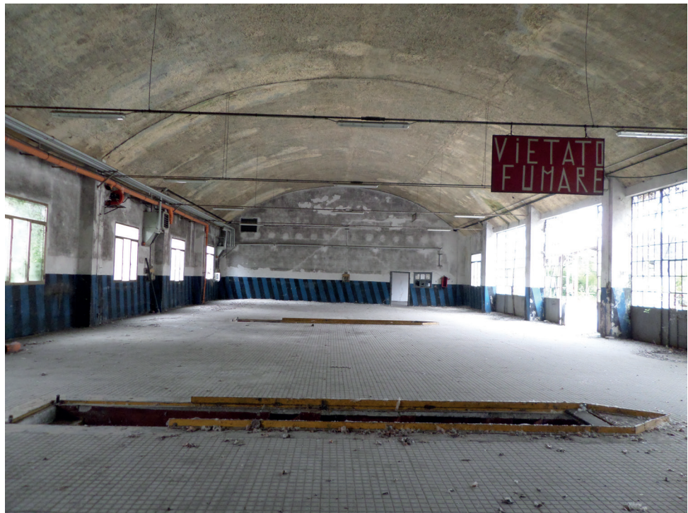
Figure 4: An empty hangar