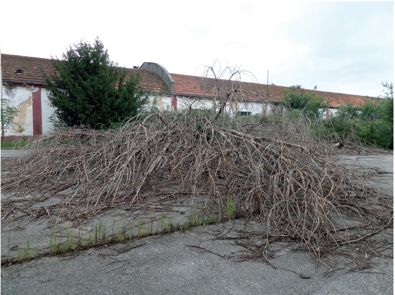
Figure 5: A fallen tree