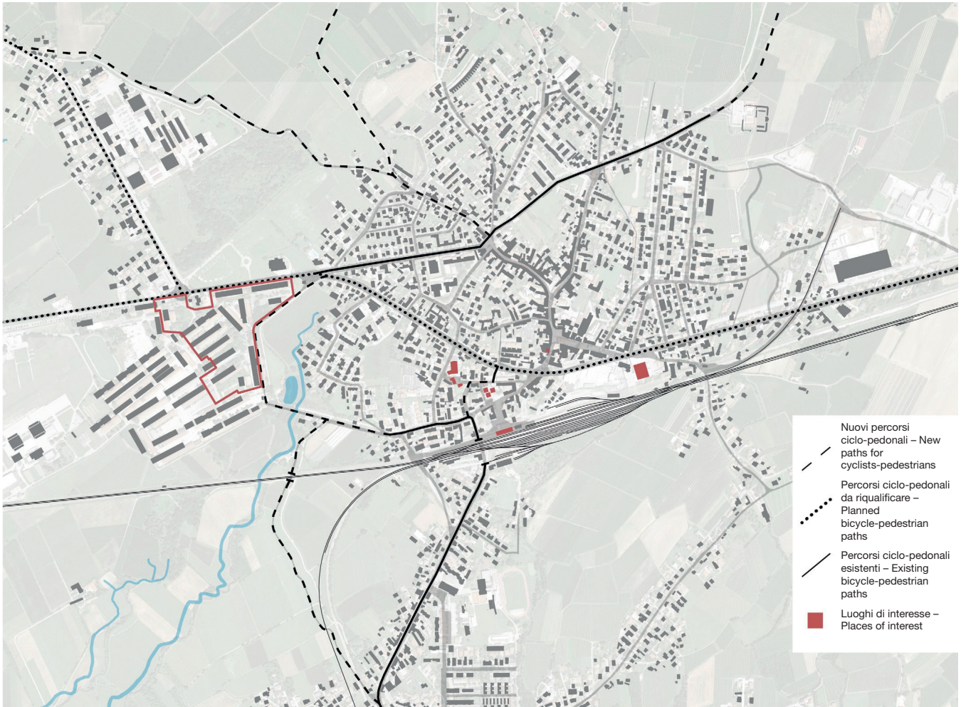
Figure 1: The Trieste Barracks area in Casarsa della Delizia. The historic urban centre of the town has the same surface as the former military compound