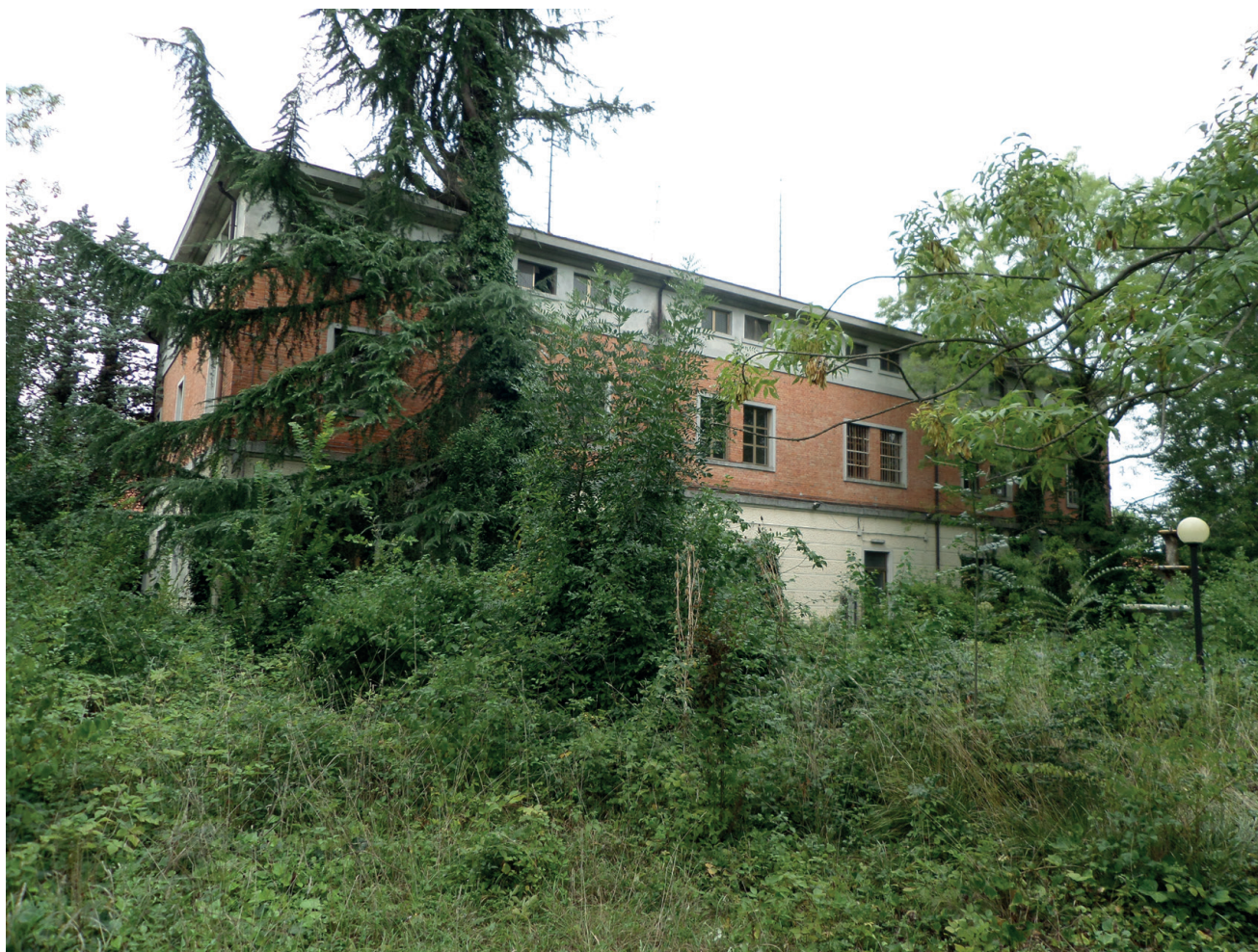
Figure 2: The vegetation has invaded the surroundings of a building

In this situation, the actors should not forget that the Trieste Barracks have a testimonial value of the war conflict memory and are a resource in architectural and urban planning terms. In addition, the barracks are totally 'off-limits' for the local community, although they are legally state property — in other words, 'commons'. This intrinsic characteristic would mean that the barracks theoretically belong to all the citizens. Therefore, several questions arise: How much time would it take to transfer the military property to the local level? What kind of function can reuse the barracks and give them back to the community? Could the enclosure be reused without removing the unforgettable Cold War memory?