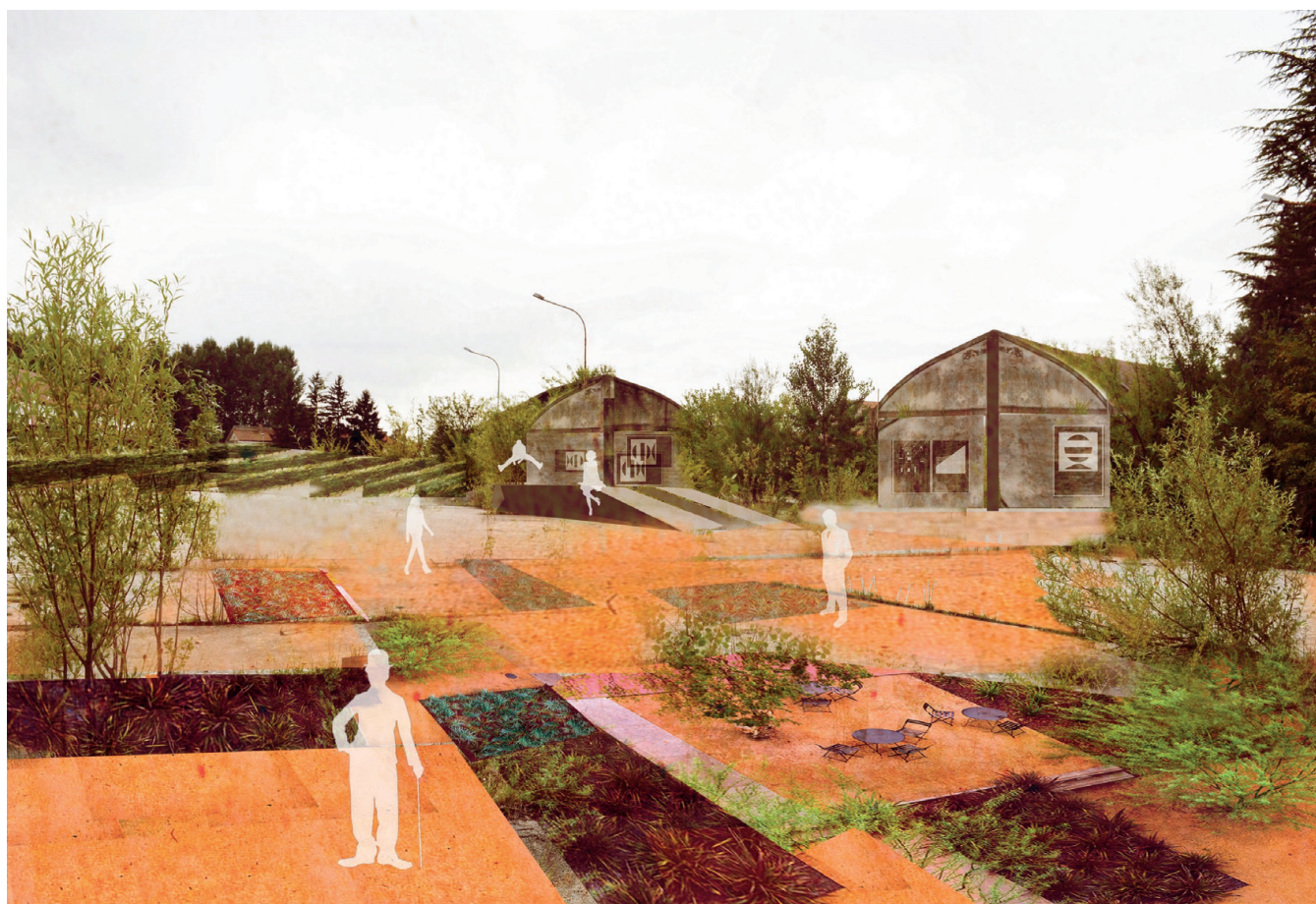
Figure 6: Adaptive reuse of the open spaces present in the former Trieste Barracks according to citizens' requests

The workshop set the former Trieste Barracks as a centre of gravity for transforming the town and its community (see Figures 6–8). The proposals outlined several hypotheses of gradual reappropriation toward the complete reuse of the neglected area. They focused on agriculture, winemaking, culture and