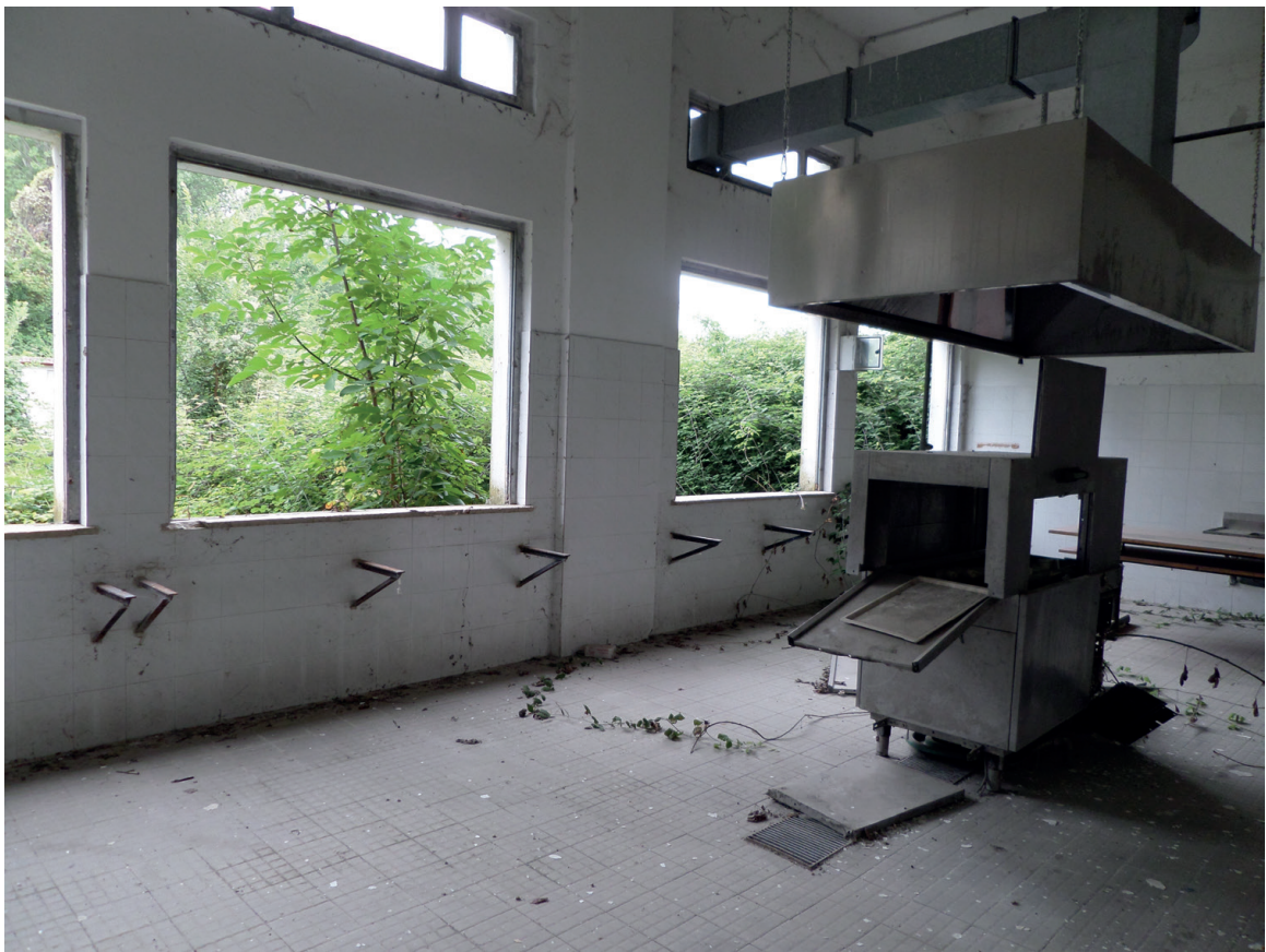
Figure 3: Former kitchen furniture